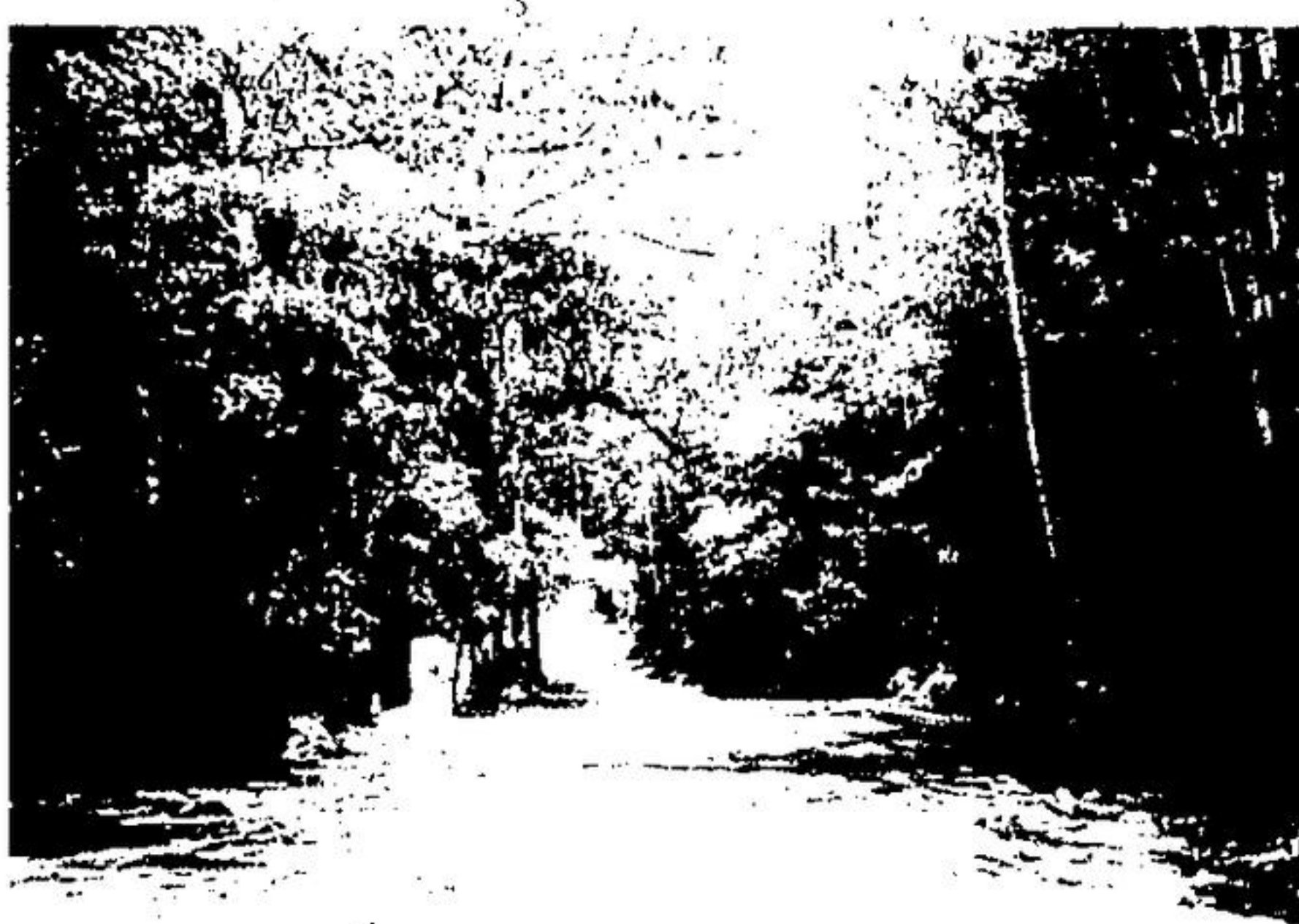
FAIRY GLEN on the 9th Line is one of the features of the unique beauty to be found on the edges of the Silvercreek Valley.