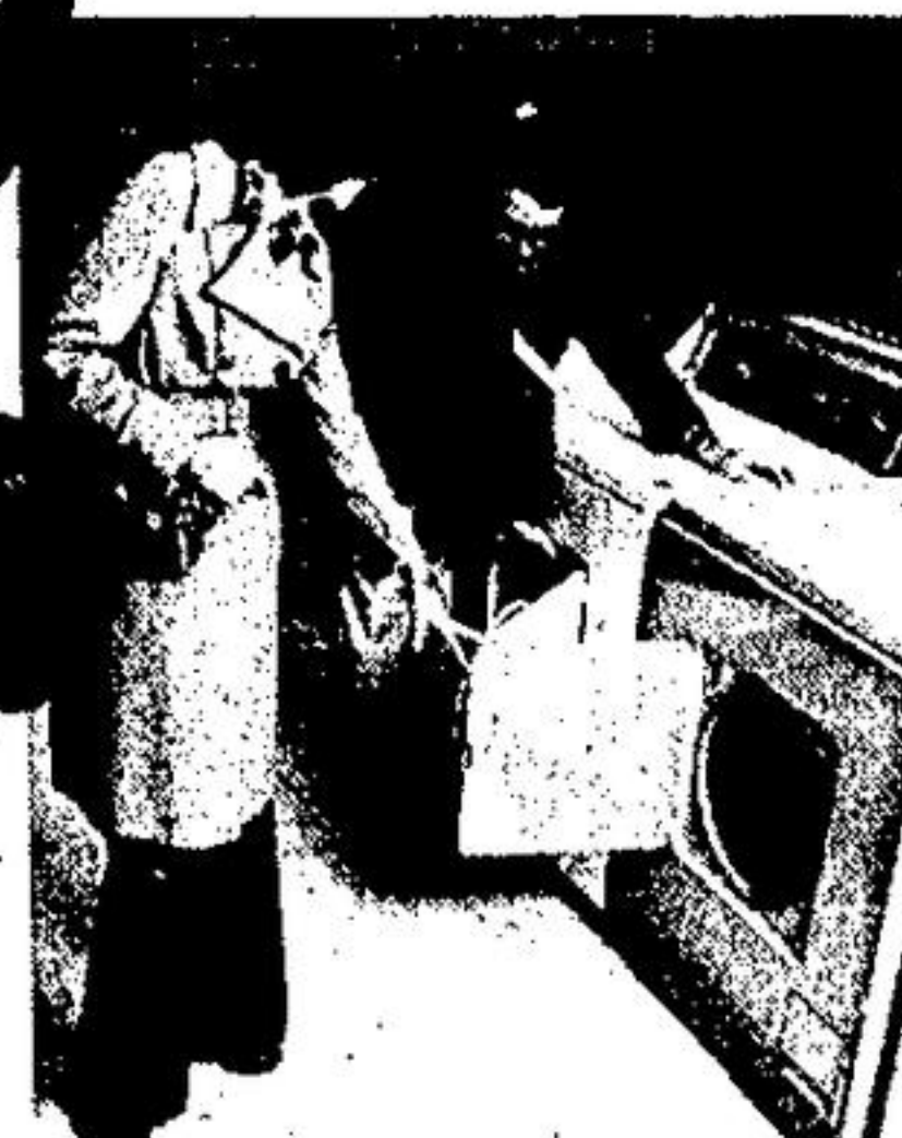
Visit your Union Gas showroom or local gas appliance dealer today and see the colourful modern gas dryers.