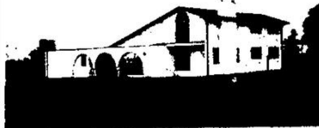
Your own castle, with grand view, located on 5 acres, just outside of Guelph, $149,500.

MOBILE HOME, 12' x 55', 2 bedroom, on serviced lot. 877-6208. 86am2-3822 END UNIT Townhouse - $3,000 down and take over excellent existing financing. No qualifying. Spacious, 3 bedroom home, finished basement. Patio walk-out from living room to fenced rear yard. Immediate possession. Please call: Ben Donohew (416) 842-1920 or Res. (416) 844-1813. 86a15-9835 TOWNHOUSE, 3 bedroom, 1 1/2 baths, finished rec. room, fenced yard. Asking $38,500. Good financing available. Private call 853-0436 after 6 p.m. 86amg16-9840 3 BEDROOM townhouse for sale in Acton, featuring large eat-in kitchen, ensuite wash-room, finished rec room, 9/4 per cent First Mortgage. With $4,000.00 down carries for $389.00 monthly including p.i.t., maintenance, cable T.V., water, fire insurance. For appointment to view call: 877-8167. 86amg15-9855