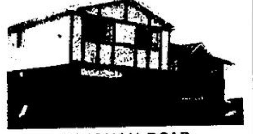
KINGHAM ROAD 3 bedroom home with family room at level, fireplace, paved drive. This home has a wide view as it is located at the highest spot of the subdivision. Mid 50's.