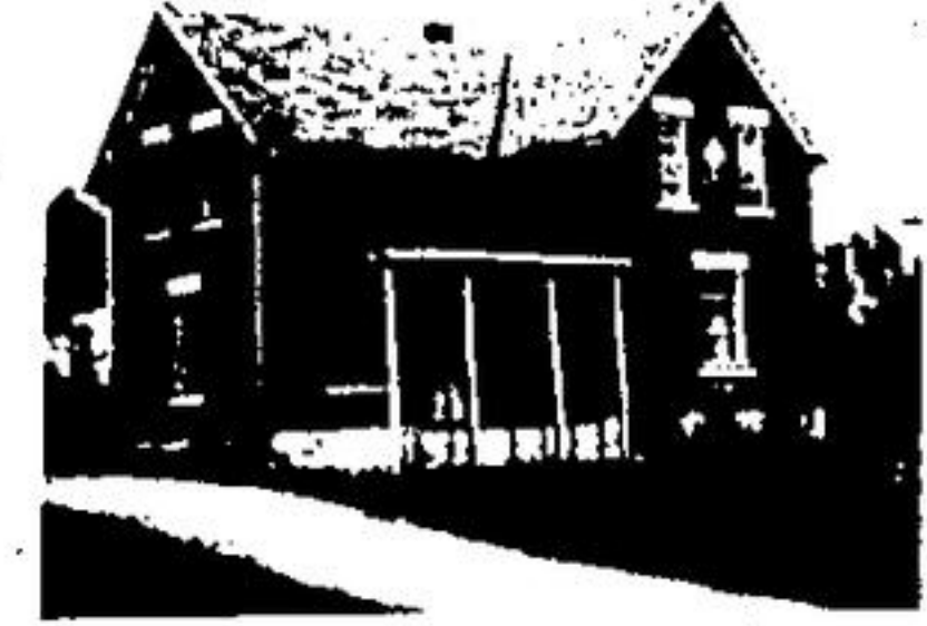
5 ACRES 6 miles north of Milton (401), 2 horse small barn—garage, above ground pool, well treed, good setting. Home has large rooms, 9 of them including 3 room apartment at back. Being renovated needs more work. $80,000's.

BAKERY Low rent, income for couple over $20,000. GEORGETOWN ACTON AREA - 35 ACRES Elegant brick bungalow, sun decks, heated in-ground pool, new block barn, second shop building, 10 acres plus pasture, mature trees.