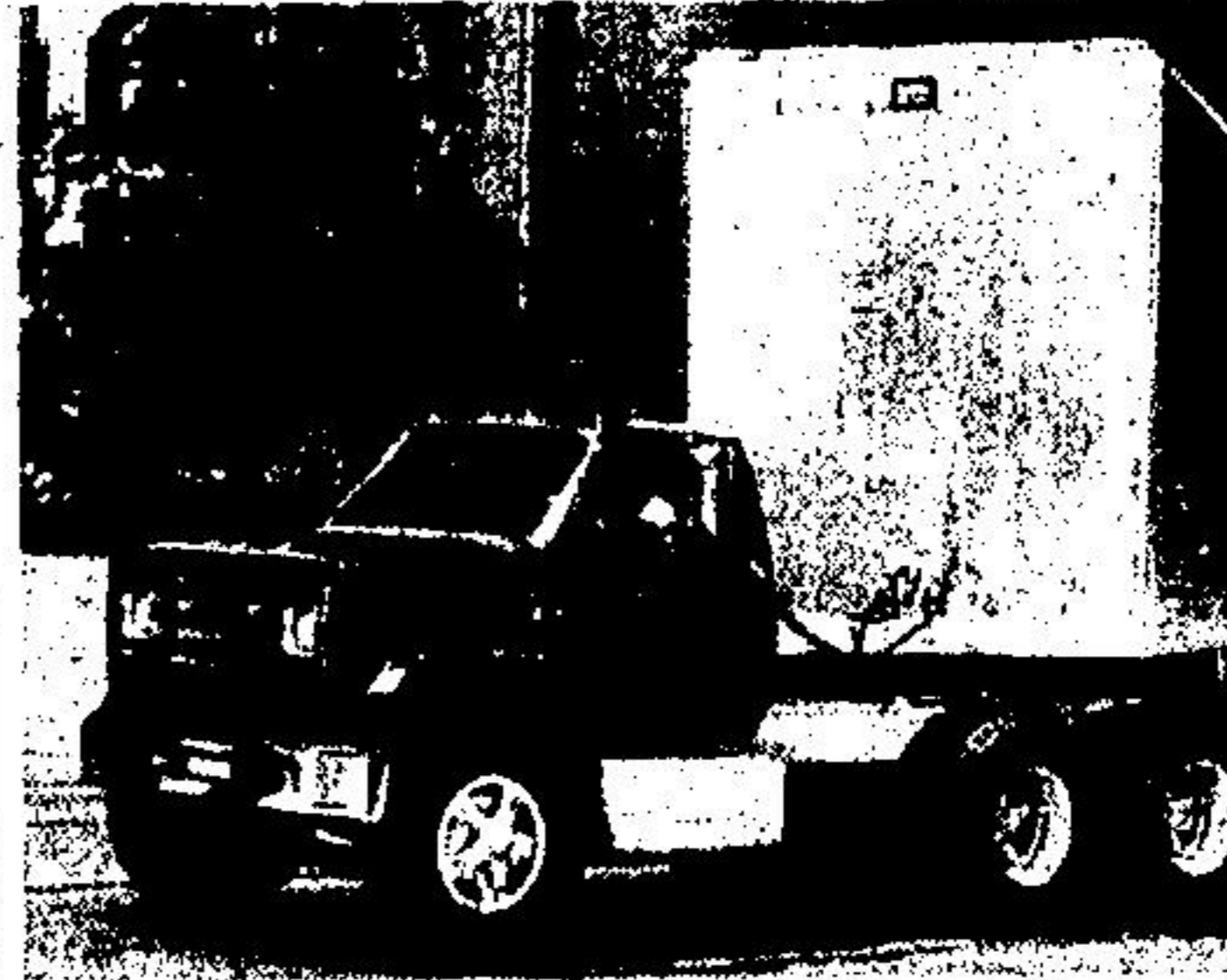
GMC Medium-duty Tandem

A GMC Truck Specialist is the person to talk with for Medium and Heavy Duty applications. Get the full story on gas and diesel jobs, single and tandem axles, conventional and tilt models—all the way to GMC's mighty Astro 95 and 1977's big truck news, the General. Talk to GMC. We're the Truck People from General Motors.