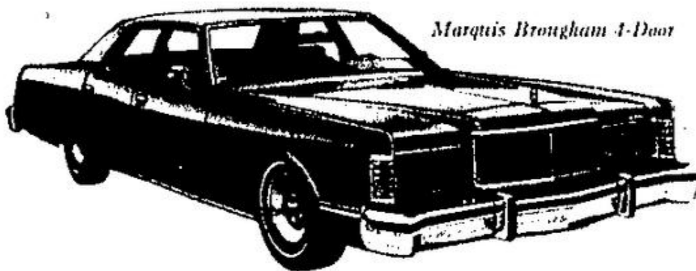
Marquis Brougham 4-Door

See all the new, exciting 1977 Marquis models. There's a wide choice, including a very affordable Marquis Meteor series.