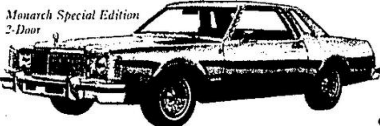
Monarch Special Edition 2-Door