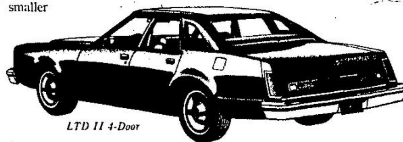
LTD II 4-Door

A full-size car that kept its full size. Ford LTD. The same interior spaciousness, deep-well trunk, road-hugging performance, long wheelbase and 3 1/2 ton rated towing capacity (with optional trailer towing package), the Ford LTD is every inch the car it was last year. (Compare this to our competitors' 1977 smaller "full-size" cars!)