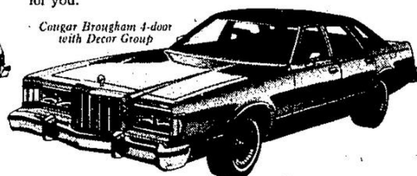
Cougar Brougham 4-door with Decor Group

For 1977, there are three Monarch series: a new Special Edition series, with a most attractive price tag; the distinctive Monarch and the fashionable Monarch Ghia. And a new 4-speed manual overdrive transmission is standard on Monarch and Ghia series.