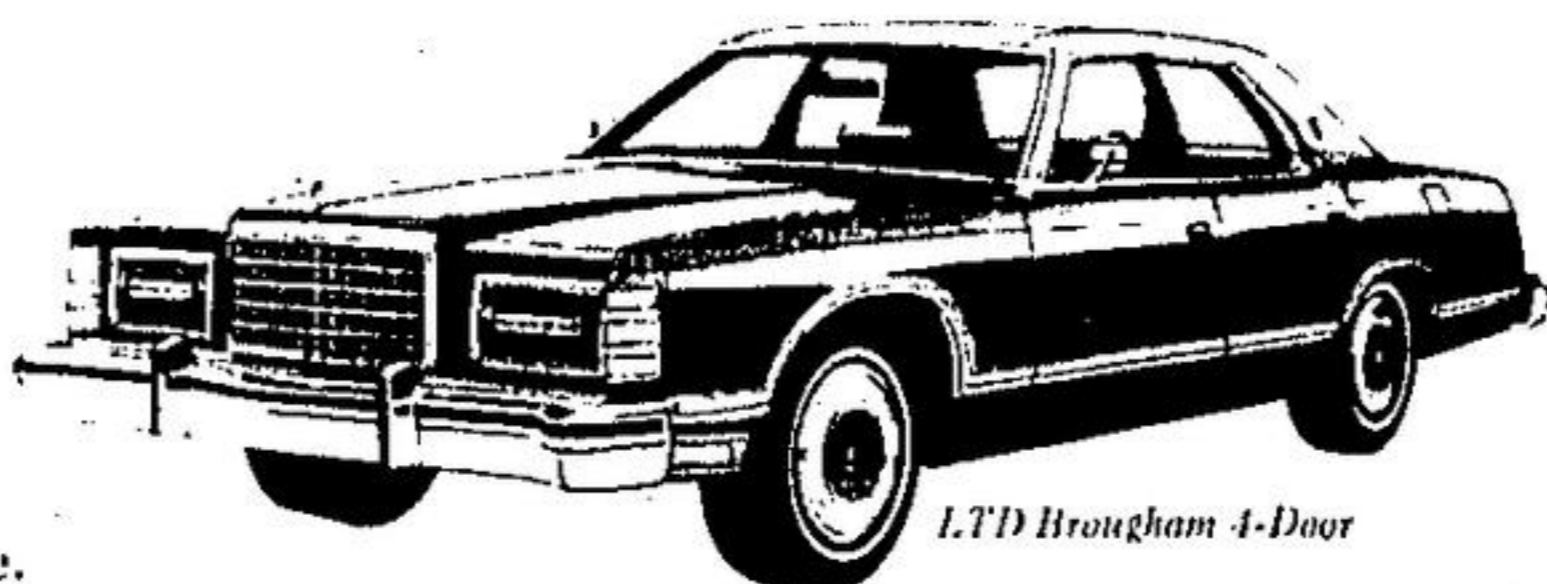
1977 Ford LTD II

A winning combination of value, economy, and performance, in a wide range of sizes and styles.