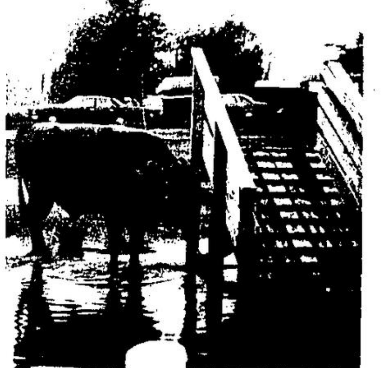
WATER WATER EVERYWHERE! This bull seems less than happy to be tied in the middle of it even though he's about to be bathed for the fair cattle classes. Friday night's rain had still left its mark on the fairgrounds early Saturday morning but organizers had it all drained by noon.