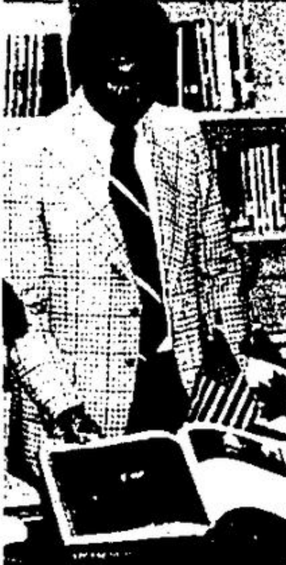
U.S. Bicentennial Gift for Library See Page 5