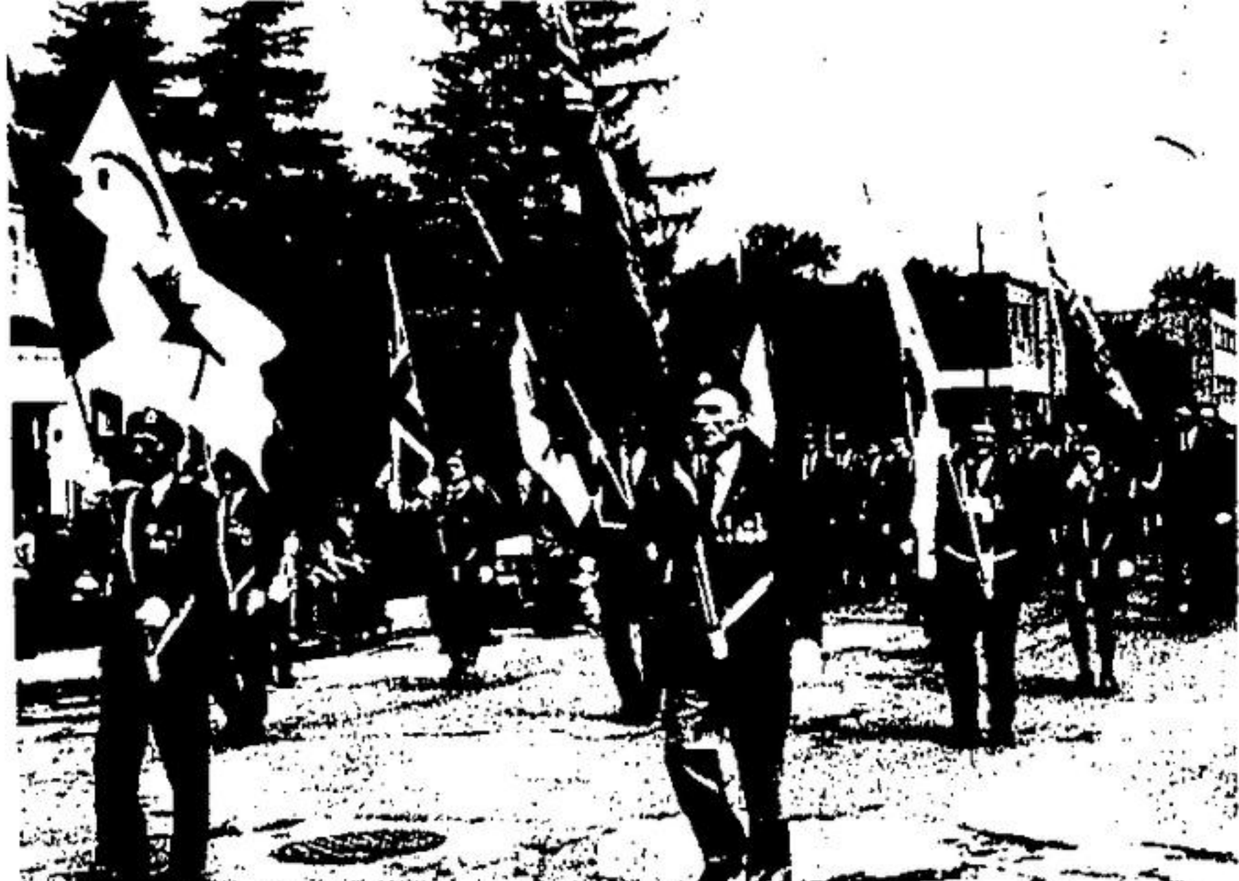
LEGION COLOR party and Legionaires marked the 50th anniversary of the founding of the Legion on the weekend, and their float took the award for best entry in the parade.