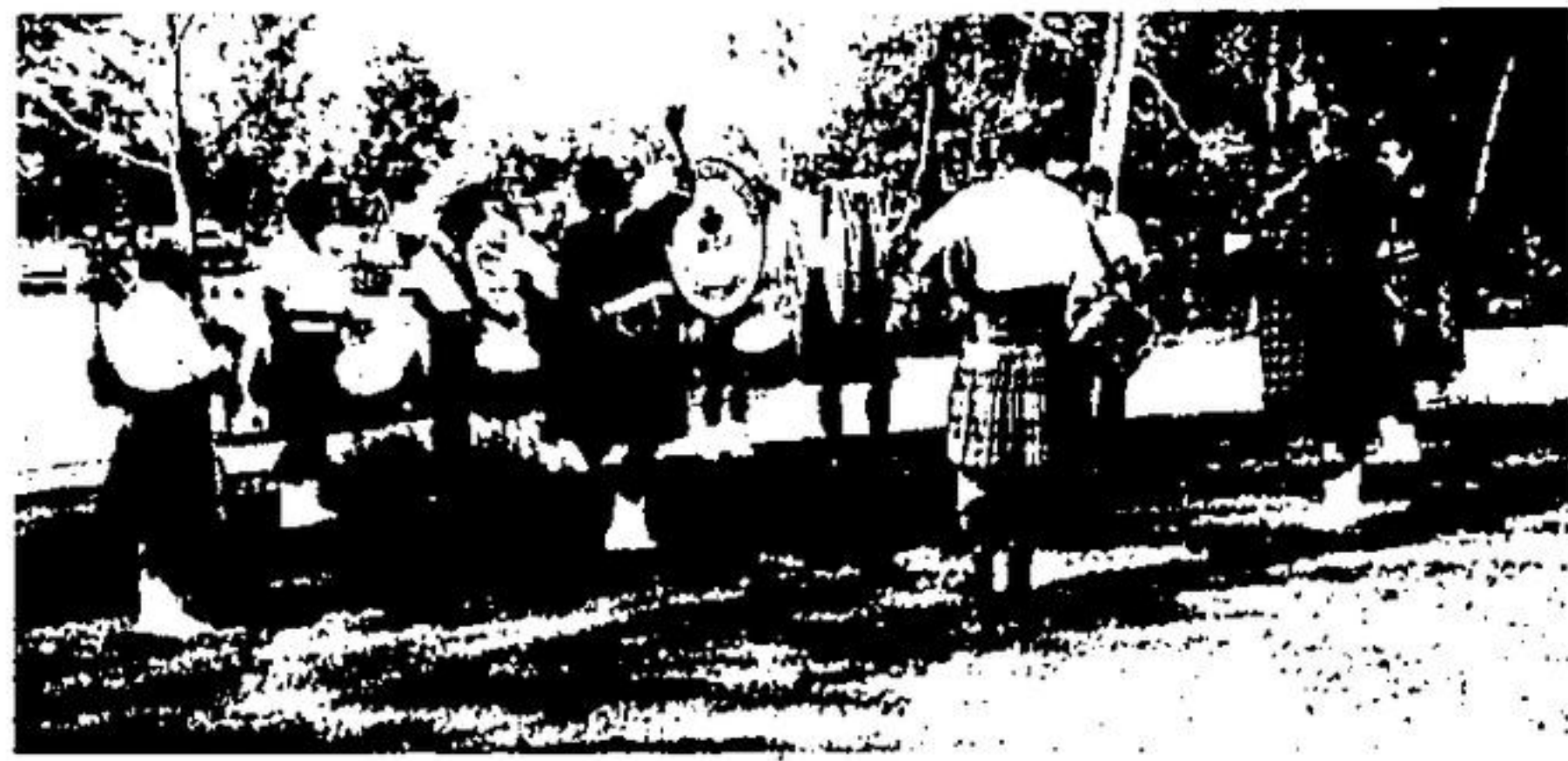
IMPROMPTU SERENADE was given Saturday afternoon by a group of players along the shore at the Legion.

BE OUR GUEST TUESDAY, 28 SEPT at 7:45 P.M. Theatricals, free coffee, make-up demo, entertainment. MURRAY MEMORIAL YMCA (downstairs) MILL ST., ACTON or phone 877-3557 for info.