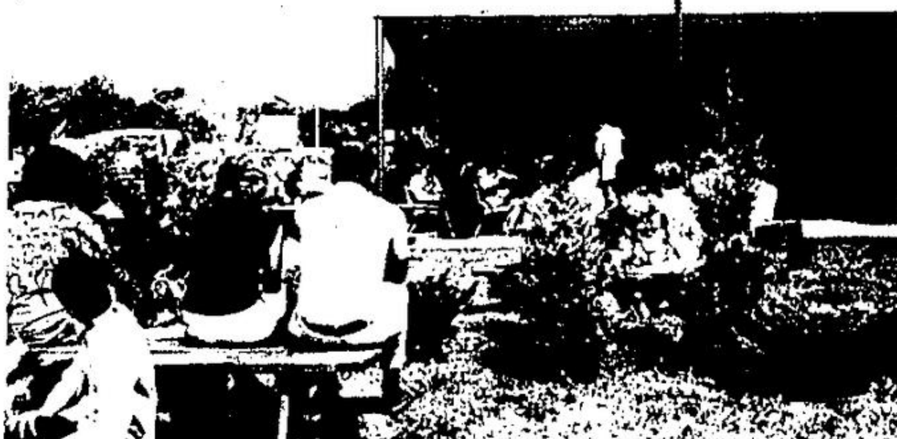
ACTON BAND played a concert in the shadow of the patio at the Legion Sunday afternoon. Groups chatted and picnicked as they listened to the band and Chorales.