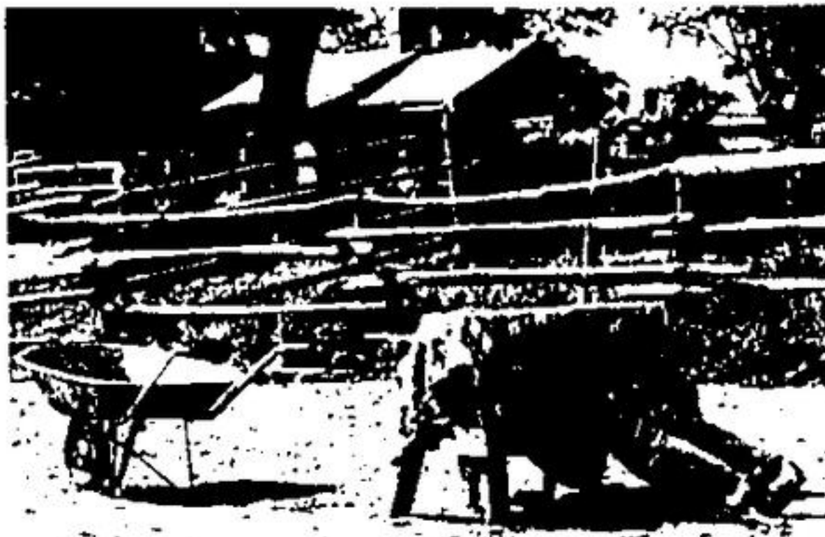
WHAT AN OBSTACLE! Park your horse, then slide through a table, grab the wheelbarrow and try to win first place ribbon in the obstacle race at the Rockwood Trail Riders Junior Fun Day.

The trustees claim the damage is due to the excess traffic going over the bridge when a detour around Rockwood was in effect for water and sewer construction. The council forwarded the letter on to the county engineer.