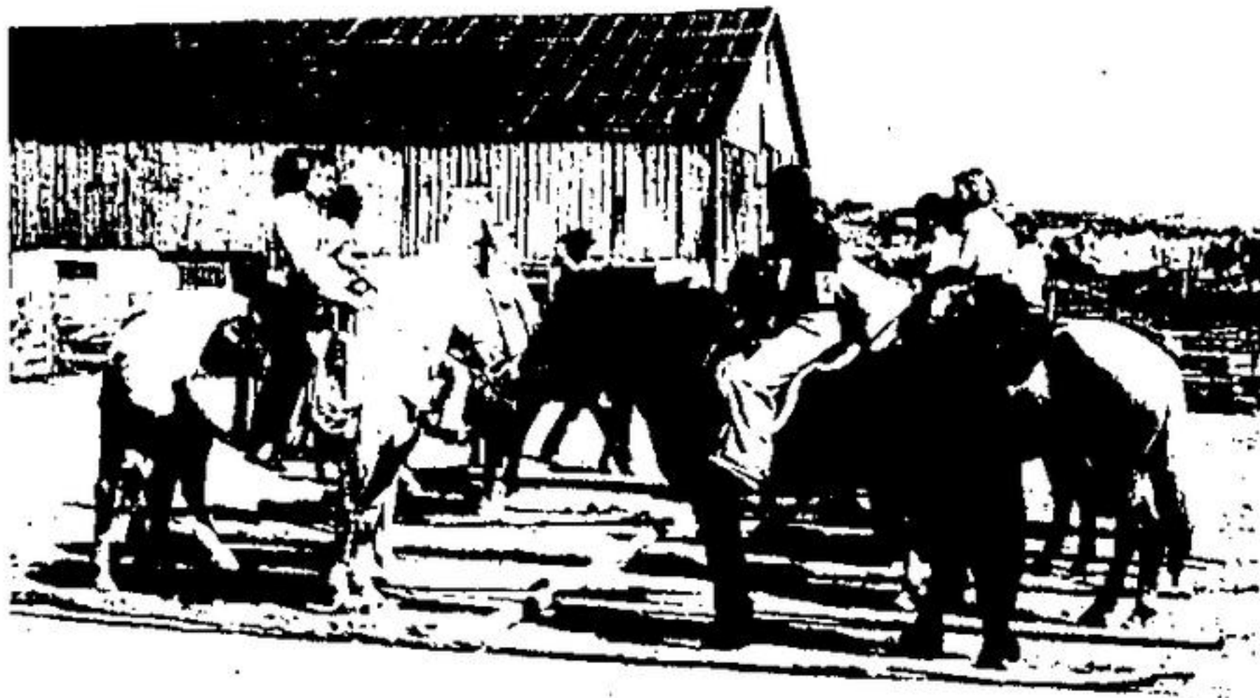
ALL LINED UP NEATLY for musical stalls these Rockwood Trail Rider junior members wait for the music to start at the Junior Fun Day, Sunday.