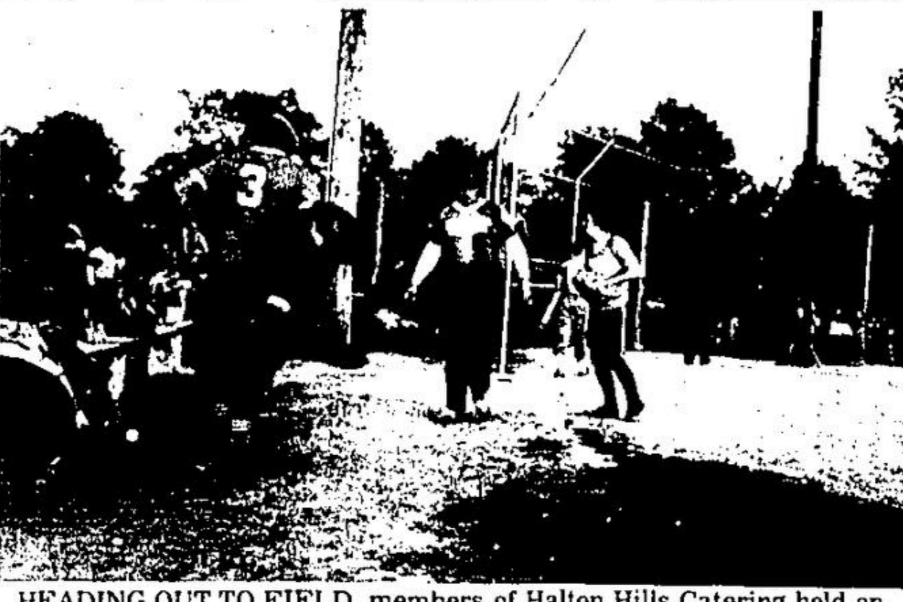
HEADING OUT TO FIELD, members of Halton Hills Catering held an early lead during their industrial league softball playoff against Halton Hills Electric Monday. Electric rallied for a 14-5 win. Next game in the best of three game series goes tonight at 7 p.m.

The two teams tied with 14 wins to 16 losses in regular season.