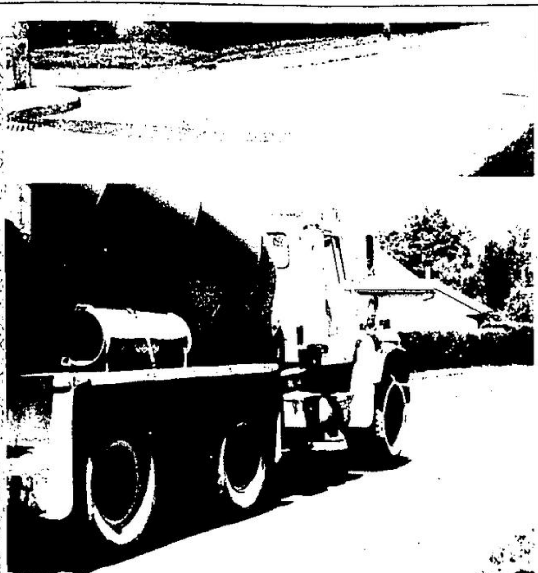
BUMP was built across Mill St. W. Thursday in an attempt to prevent water from running down Cameron Ave. Flooding has been a problem there since the road was paved. Second coat of paving is planned for Mill and that should solve the problem, says the works department. Here, a truck bangs over the bump.