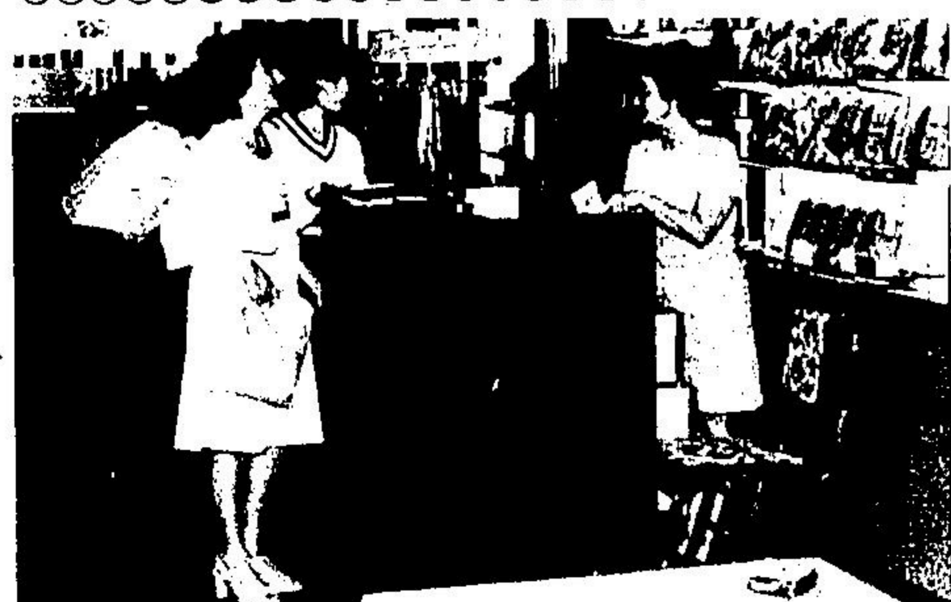
Customers and manageress at Kern's Jewellery.