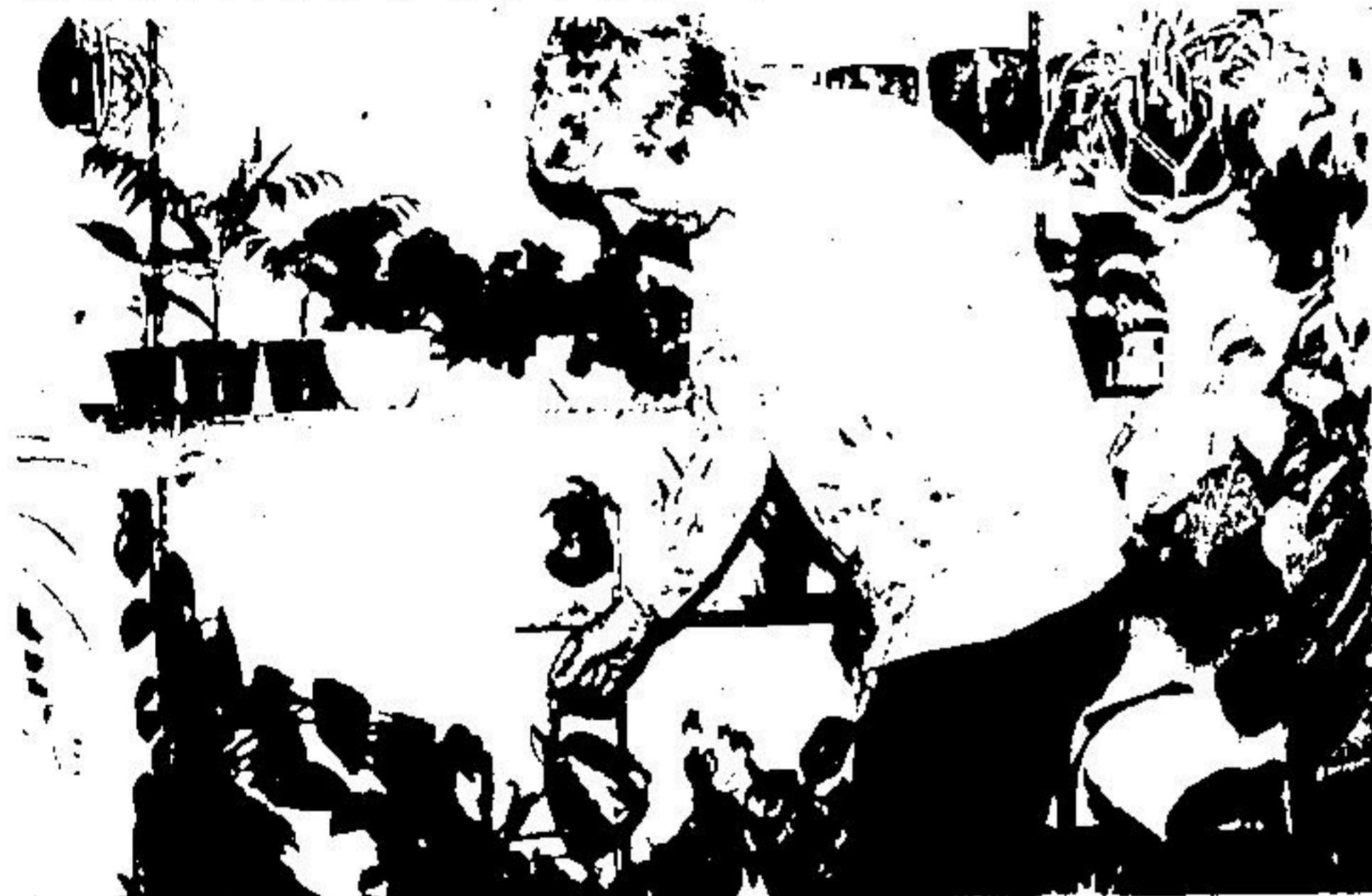
Arranging flowers at Vanderburgh Flowers.