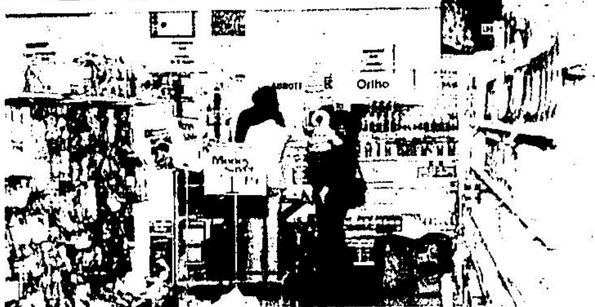
Prescription counter at Shopper's Drug Mart is a busy place.