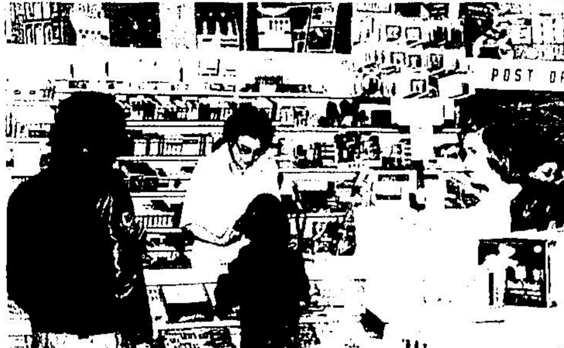
Delrex Smoke Shop is a favorite stop.