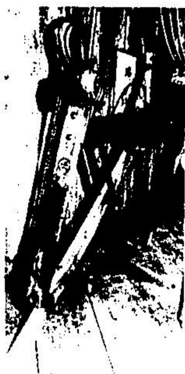
GRINDER (above) had a seat for the operator. The early phone (right) is one of several the Mus- eum owns.