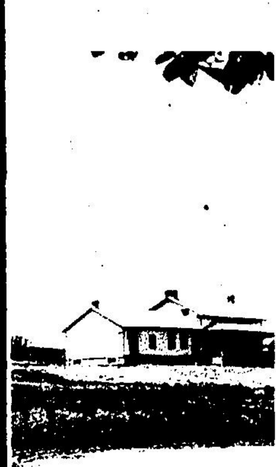
x. The frame house was built in ns shortly after that.