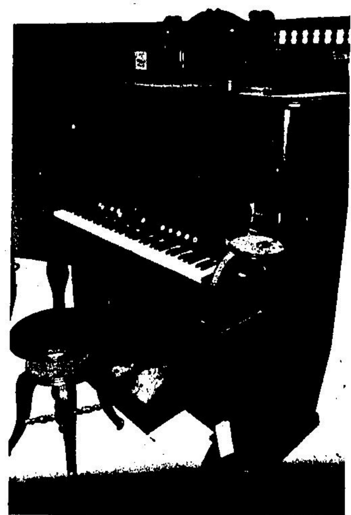
BELL ORGAN was built in Guelph in 1902. It is still being restored, as are many of the Museum exhibits.