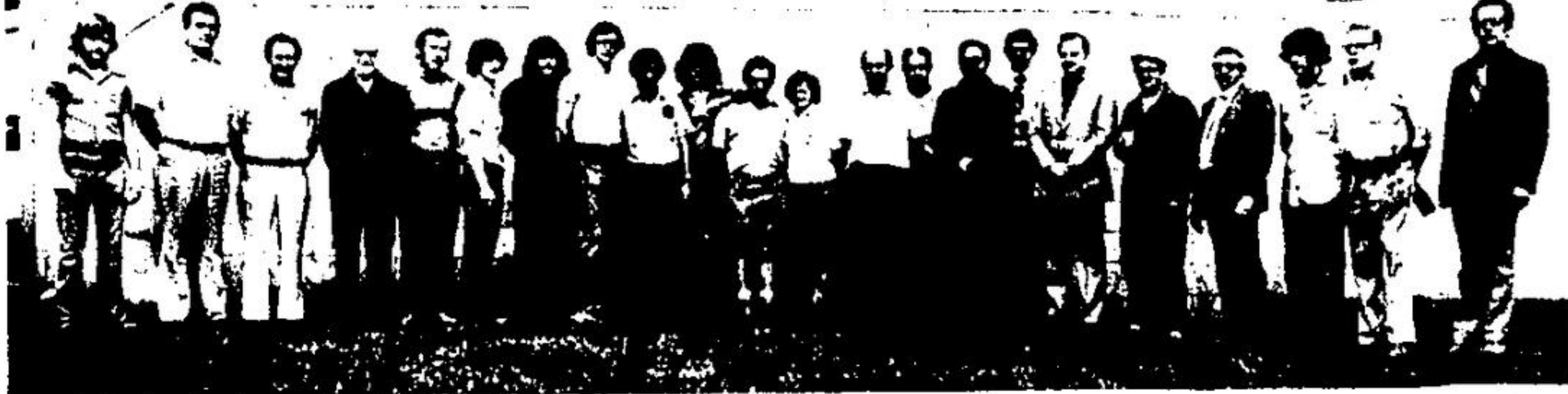
THE LONG BANNER AT THE BUILDING Products plant on Highway 25 says it all. For the last two years the 121 employees have worked without a disabling injury. The occasion marks the second time the plant has gone for two years without such injury. The plant is looking forward to the coming

September when it hopes to pass the half-million man hours mark without an injury. One car in the company's parking lot carried a miniature of the white, green, black and red banner, in the form of a bumper sticker.