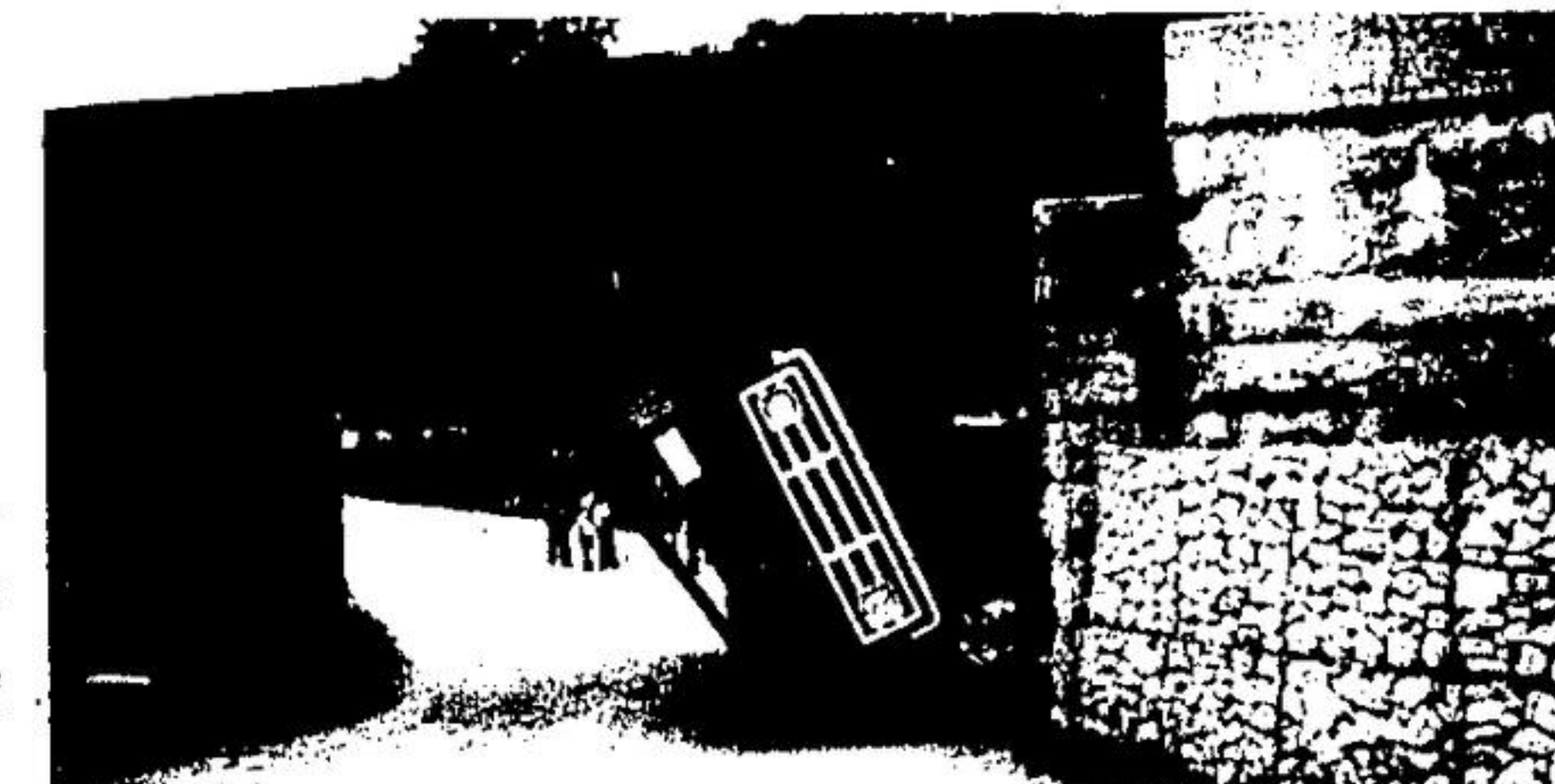
TRUCK IS WEDGED against wall of railway underpass at Crewsons Corners, its wheels off the ground. Damage is estimated at about $3,000 to the truck, $300 to the track.