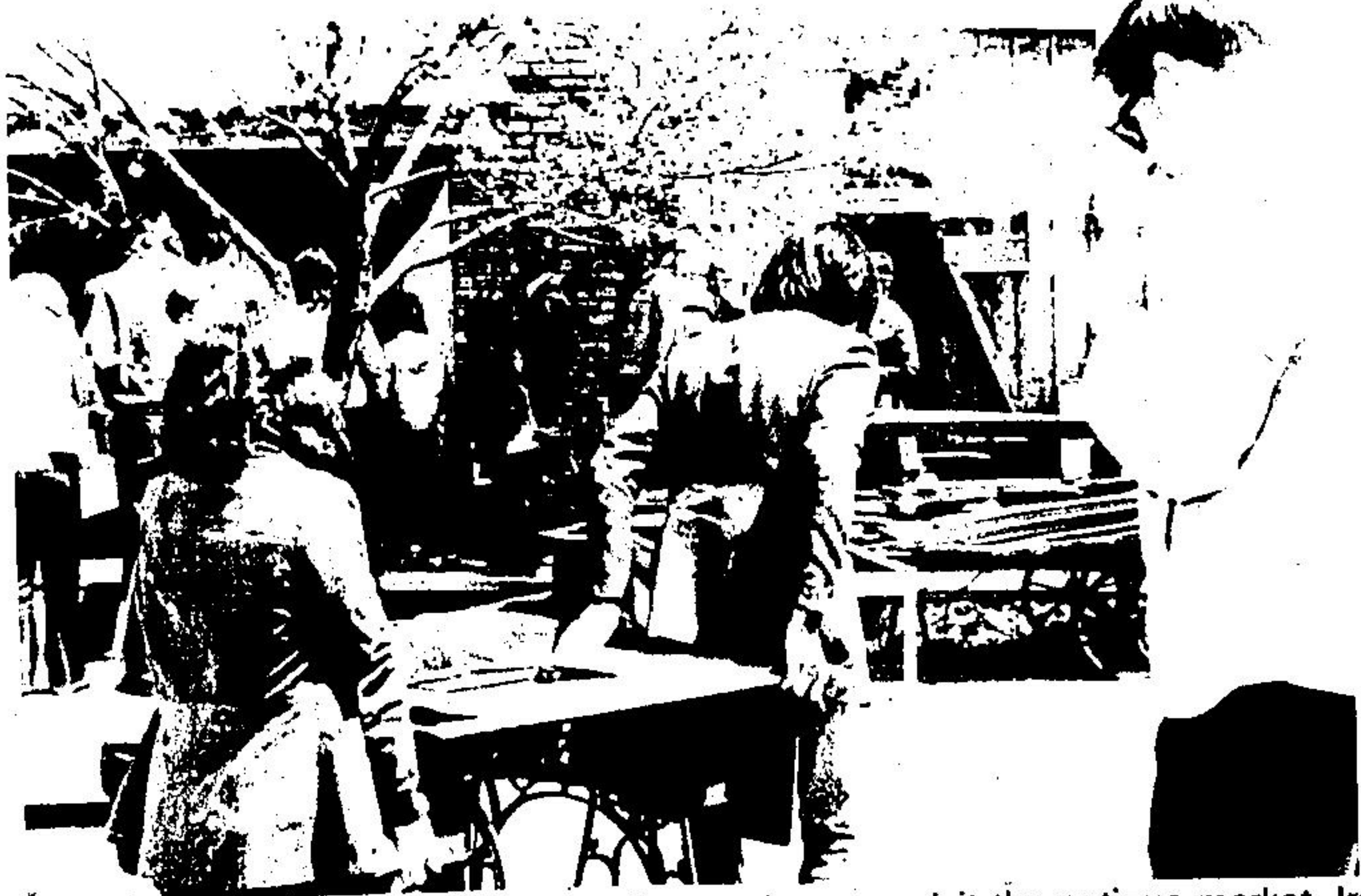
You never know what will hit your fancy when you visit the antique market. In the background is the Slaughterhouse.