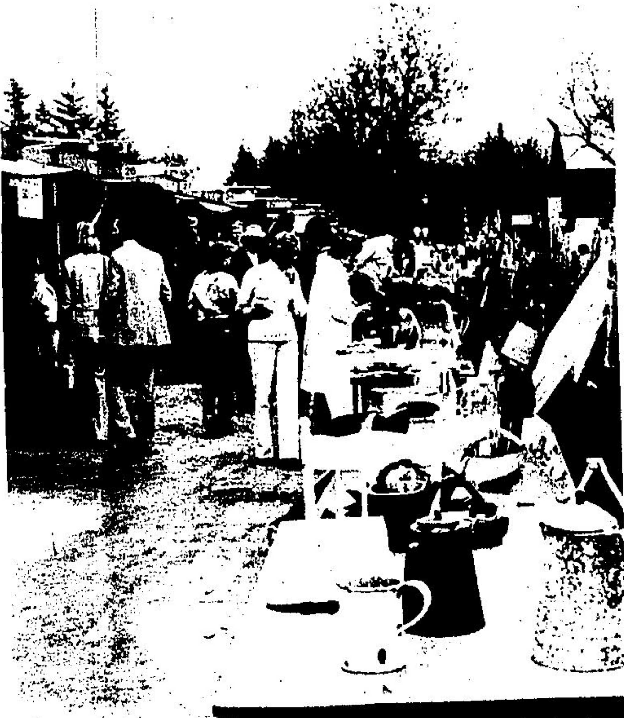
Strolling through the hundreds of booths at Aberfoyle is a fun way to spend a Sunday.