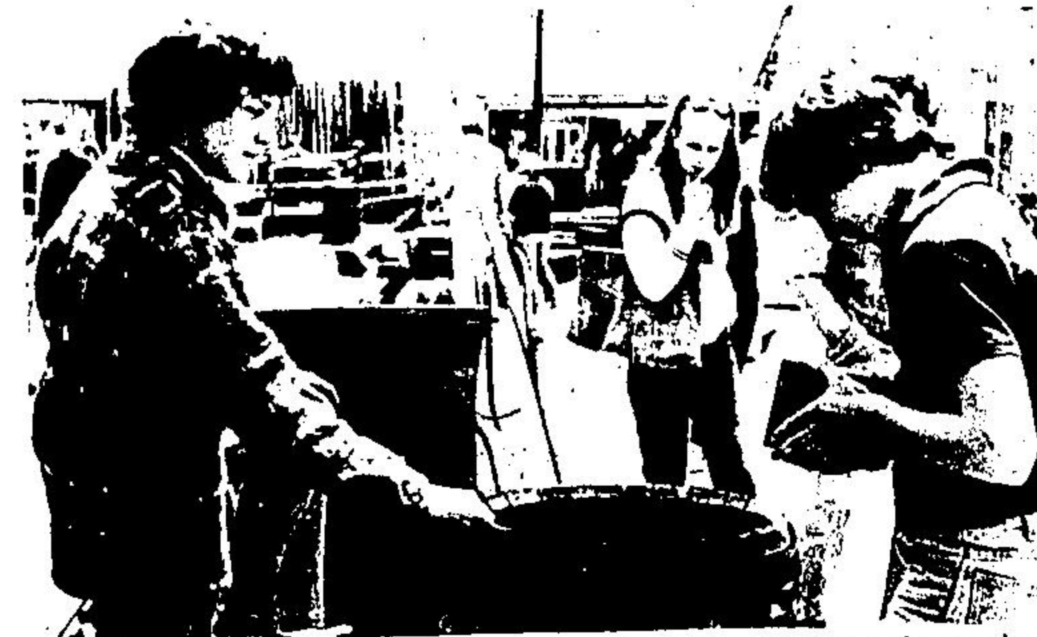
Brothers play with an old camera they found for sale at the market and pretend to be taking each other's picture.