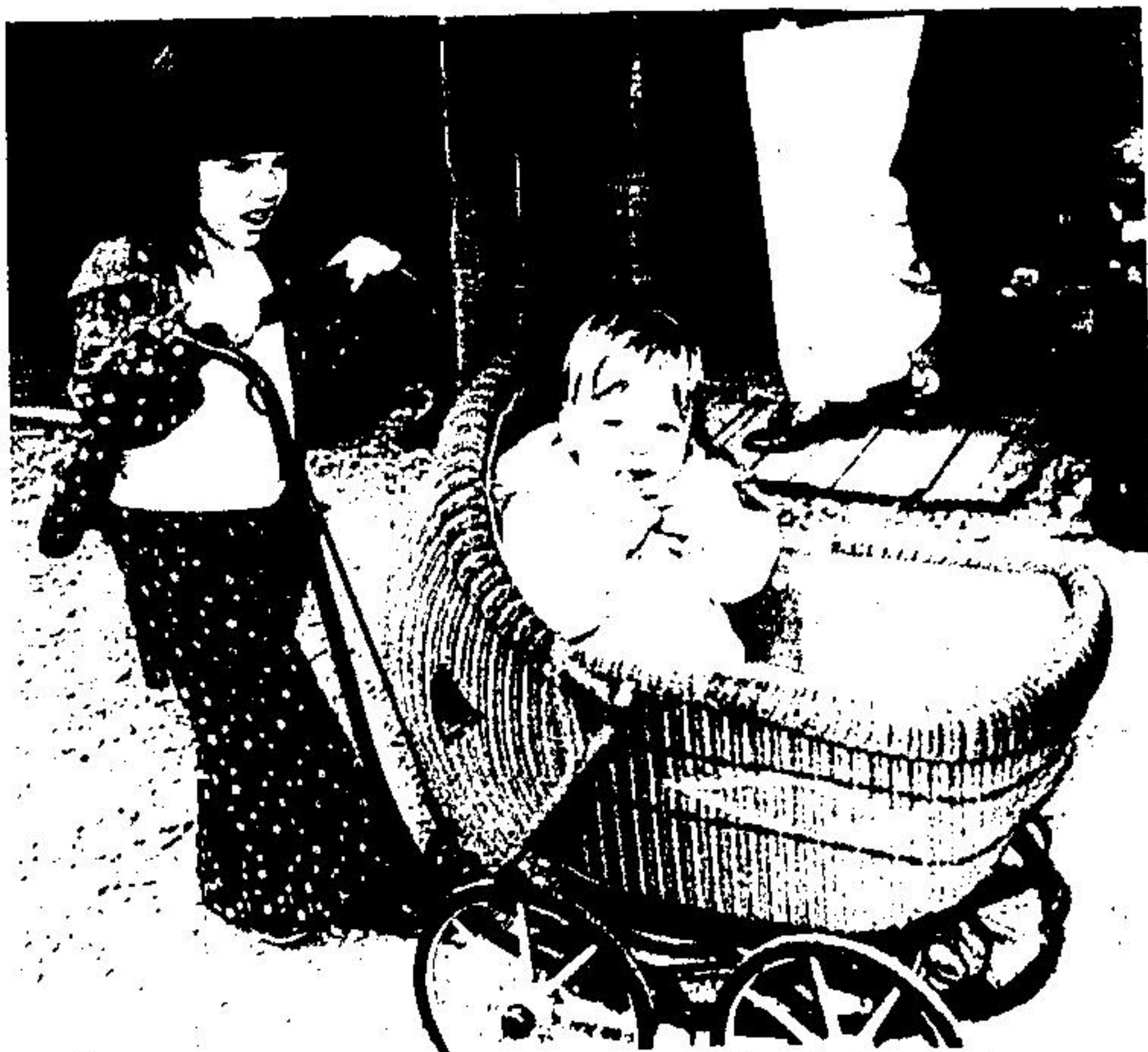
This young couple found the old wicker baby carriage an interesting plaything.