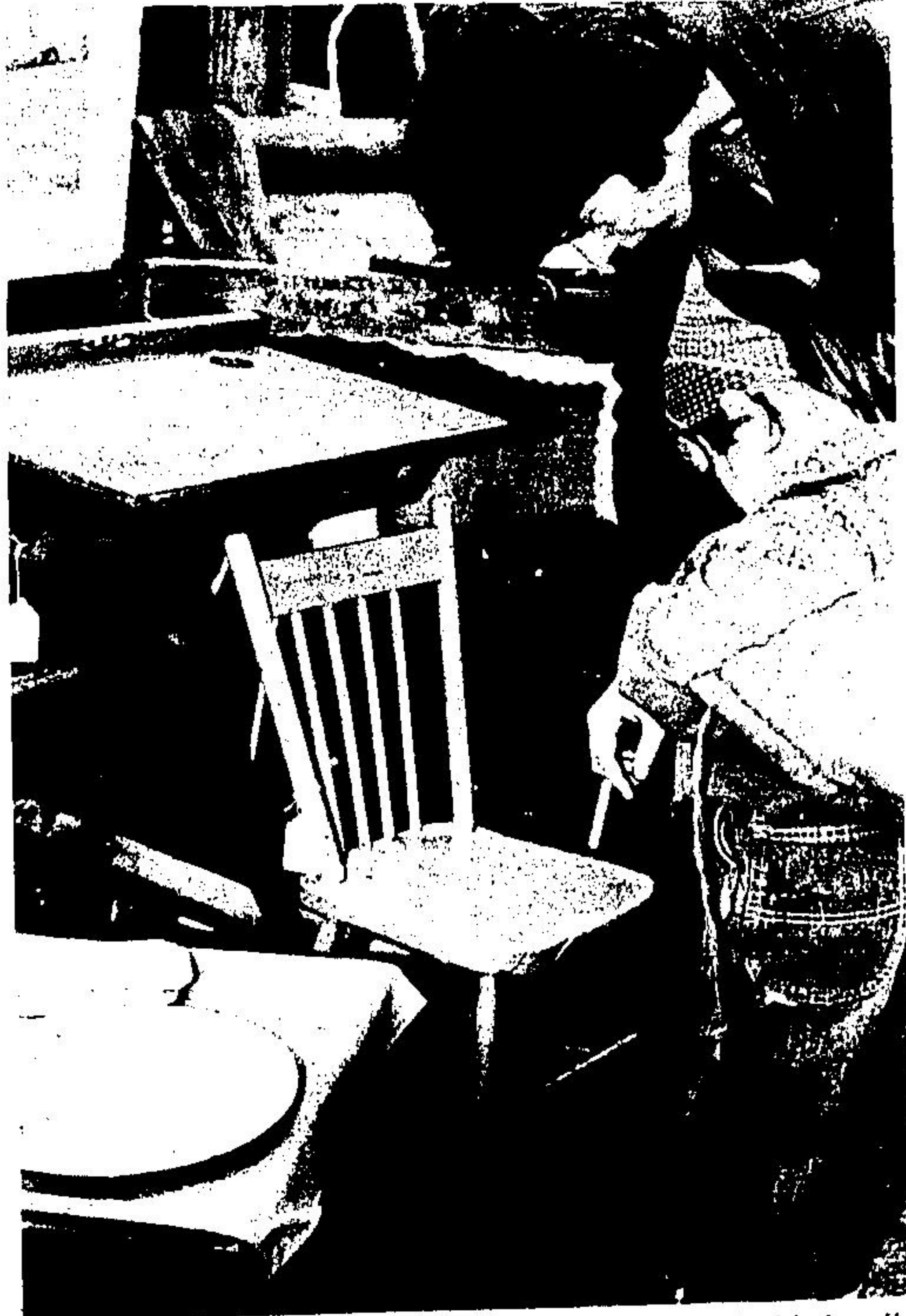
A little girl is told how things were in "the good old days".

It's the fashionable thing to do these days to put on a blue denim suit and join the thousands of visitors to the Aberfoyle Antique Market. Each Sunday from 10 a.m. to 5 p.m. the small village of Aberfoyle on Highway Six is lined with cars as visitors poke their way through the piles of antiques — looking for treasures.