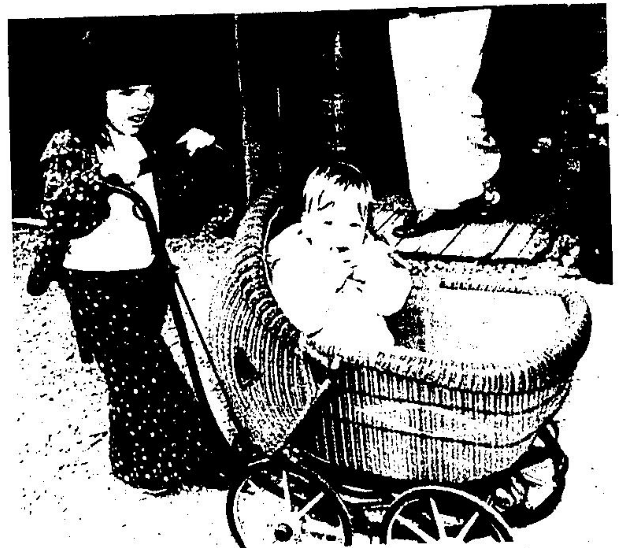
This young couple found the old wicker baby carriage an interesting plaything.