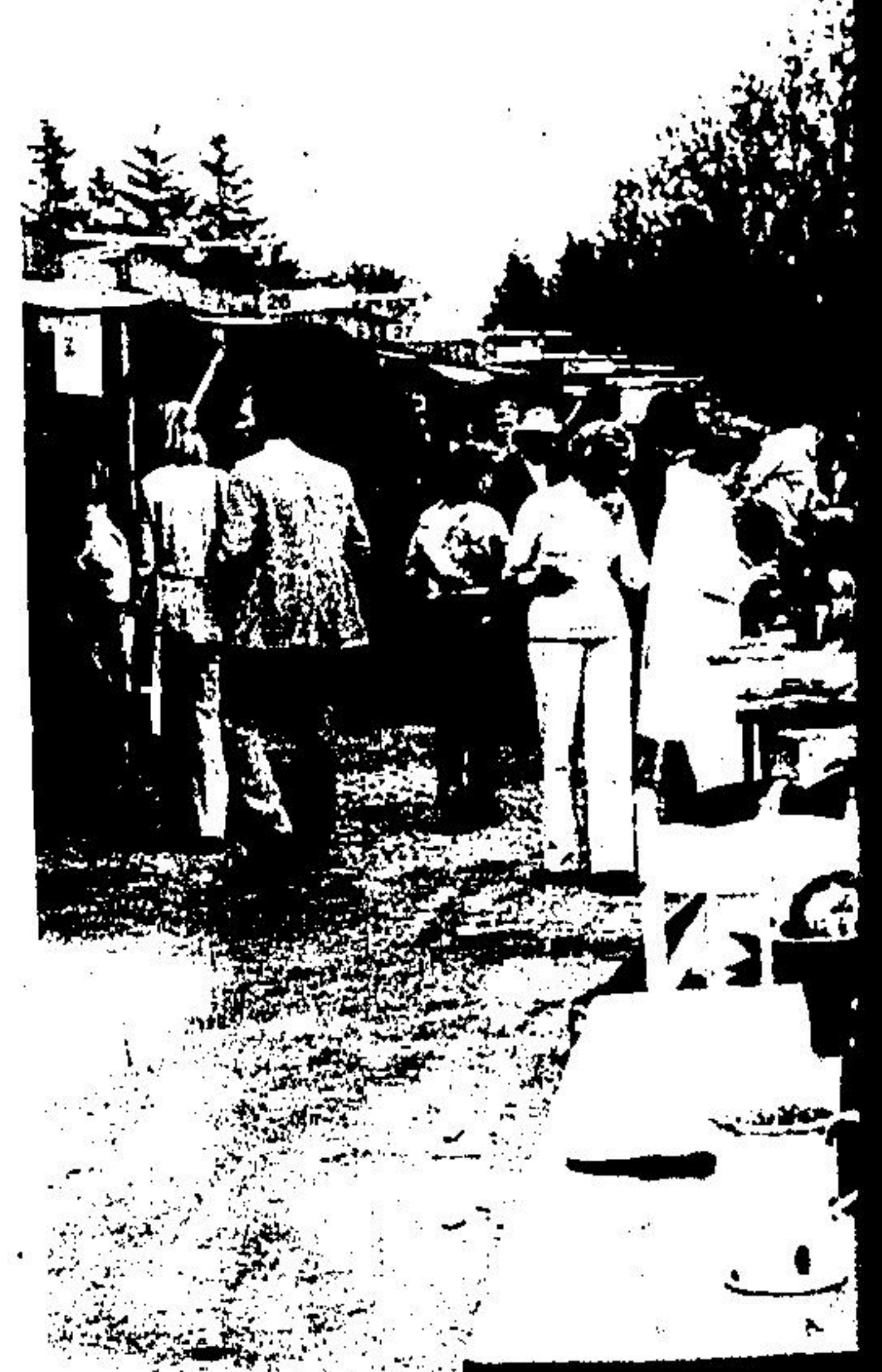
Strolling through the hundreds of boot fun way to spend a Sunday.

For the young visitor, Aberfoyle is a living history lesson. For the older folk it's a trip down memory lane.