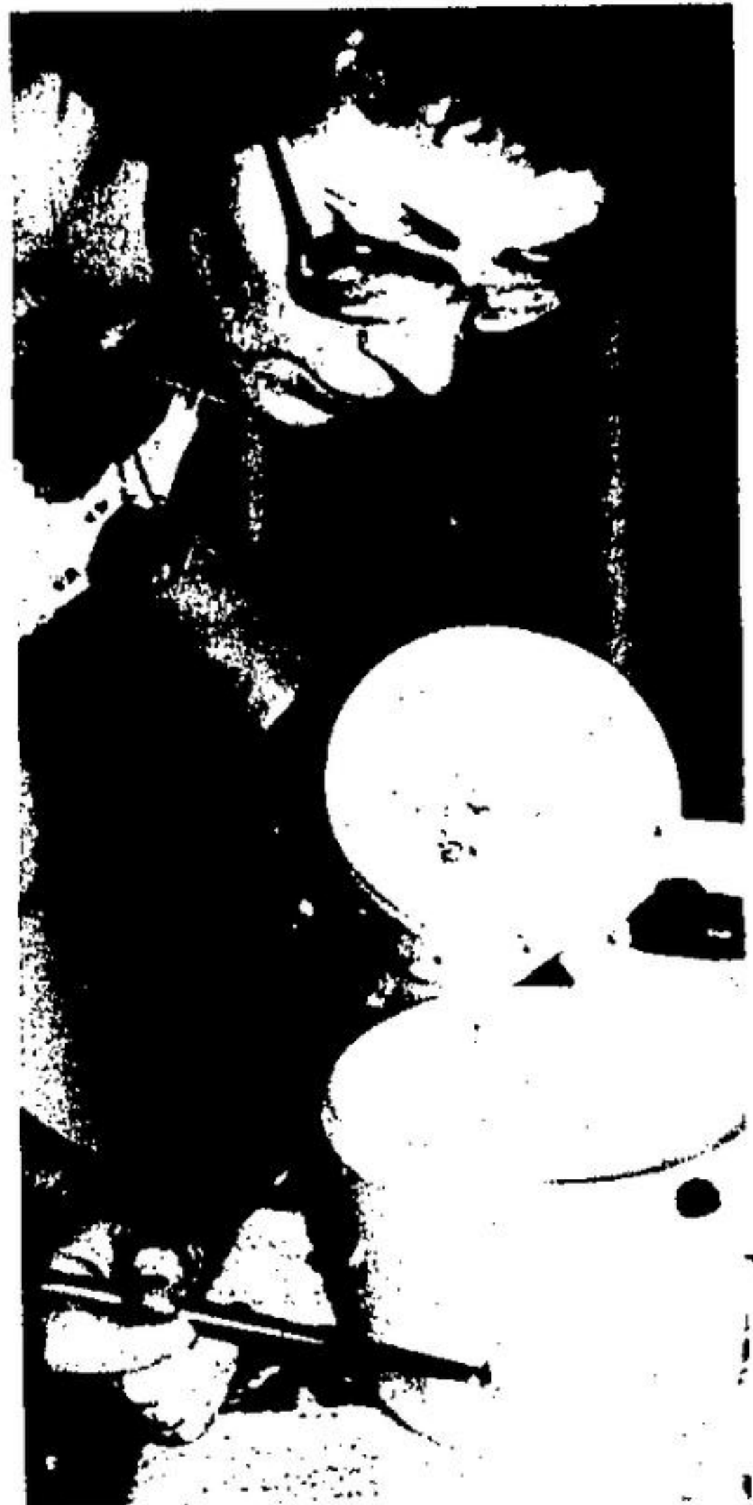
CONTAINER OF silica sand is filled with tiny treasures—here, a perfectly preserved fuchsia bloom, wired with a tiny stem.