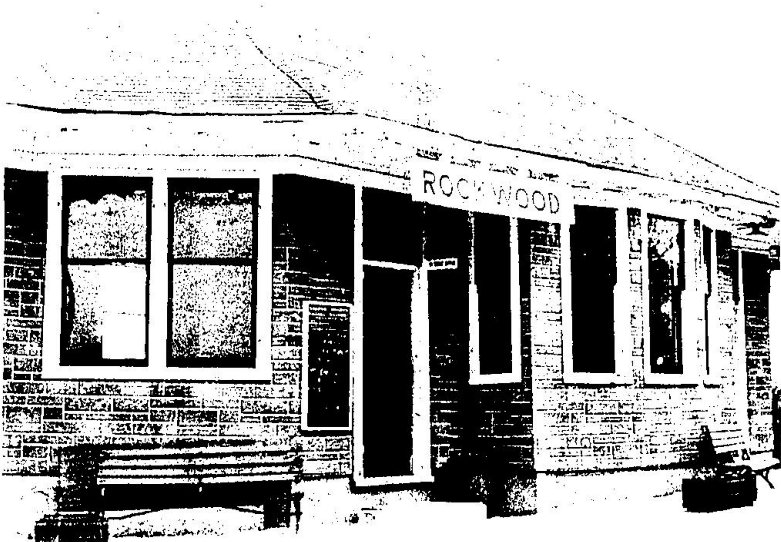
Rockwood train station built in 1912 was moved to the Guelph Line Site of the Halton County Radial Railway.

TRAINING CAR EXHIBITION WEST ENTRANCE EXHIBITION EAST ENTRANCE DUFFERIN VIA KING VINCENT VIA PARLIAMENT ERINDALE VIA PARLIAMENT PRIVATE EXHIBITION KING ST. CLAIR BICKNELL WOODBINE CONNAUGHT NEVILLE MCCAUL BIRCHMOUNT HUMBER SUNNYSIDE