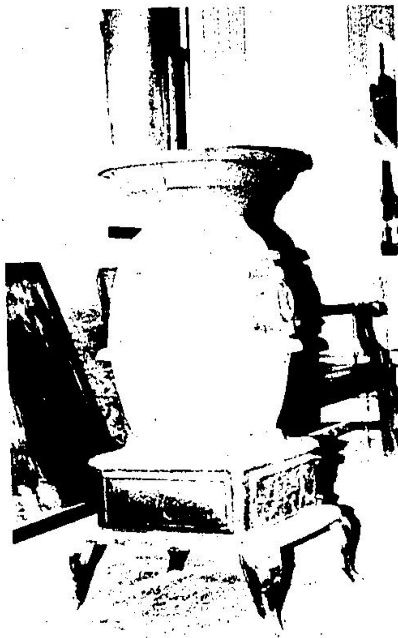
Pot belly stove sits in station.