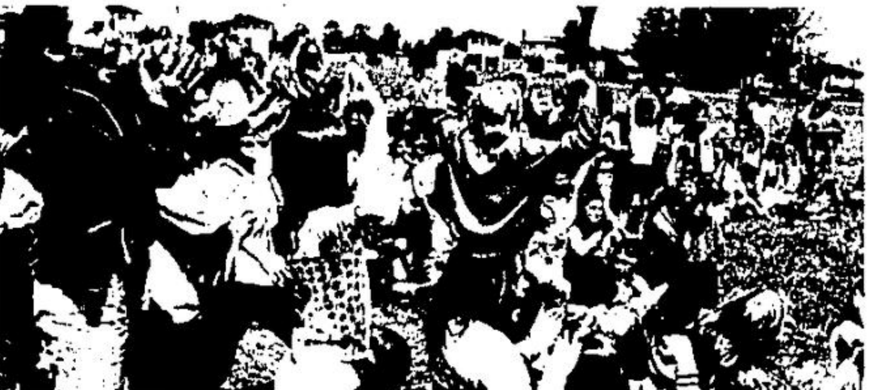
CHEERING WAS PART OF the celebrations following announcements of the five-school track and field meet at M. Z. Bennett last Wednesday. The host school came out on top, followed by Robert Little, Brookville, Limehouse and Speyside.

86. REAL ESTATE GEORGETOWN—Scenic ravine lot on quiet crescent. 4 bedroom split. Cash to mortgage. No agents. 877-5409. 86g9m36 1846