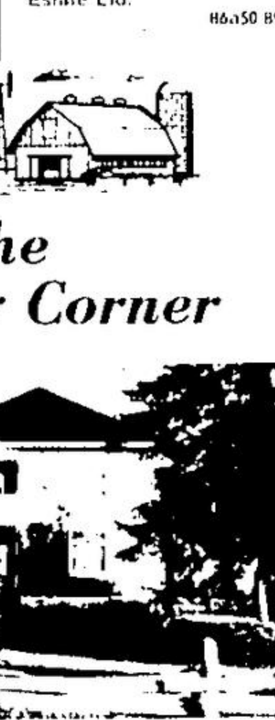
ON STOREY DRIVE ACTON

EDEN MILLS 2 bedroom brick bungalow with fireplace on over 1/2 acre of land. Asking $46,000. BUILDER'S OWN. Raised brick bungalow 1,350 sq. ft. of pleasure living with 2 fireplaces, 2 baths, rec room, garage on lot of 150 x 100'. Asking $69,500. Call Irene Pries (519) 821-3600 or Res. (519) 856-4366 representing Herb Neumann Real Estate Ltd. 86a50 8907