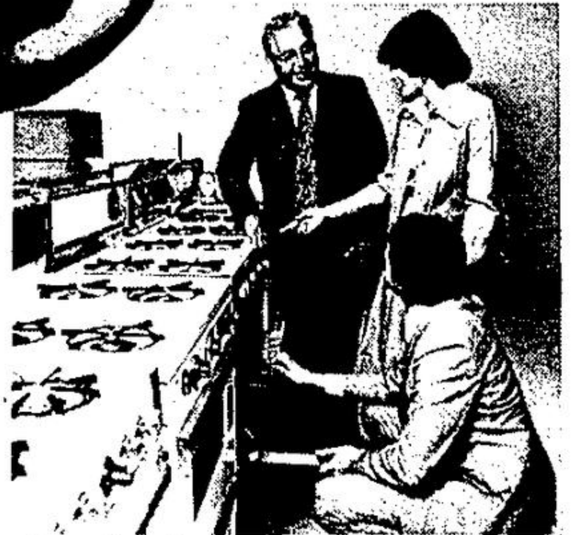
Visit your Union Gas showroom or local gas appliance dealer today and see the efficient new gas ranges. They're really worth looking into.