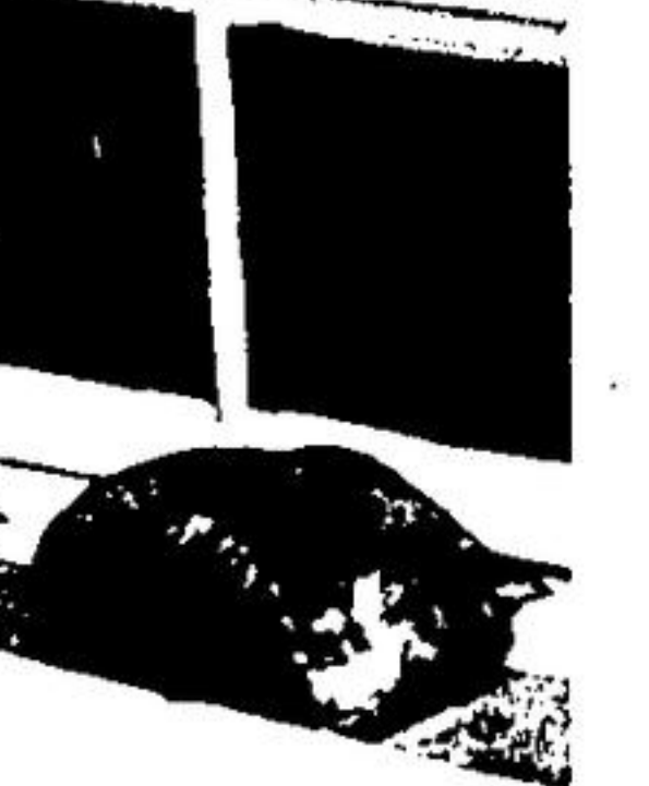
CATCHING a cat nap in Friday's warm sun was this cat. A photographer caught her in the window well of Knox church.

During the month of April there were a total of 1,660 offences investigated by Halton Regional Police resulting in 399 charges. One person was charged with a sex offence, 42 were charged with assault, 15 people were charged with break and enter, 13 were charged with theft, one was charged with gaming and betting and three were charged with possession of weapons. There were 120 charges laid under the criminal act, 45 drug charges laid under Federal Statutes, and 111 with liquor offences.