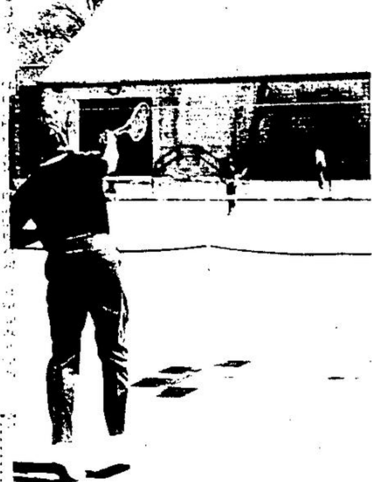
TO SERVE with love is the only way tennis enthusiasts can play their favorite sport during the recent spell of cool weather. The tennis courts are being used in mild and cool weather, during the day and evening.