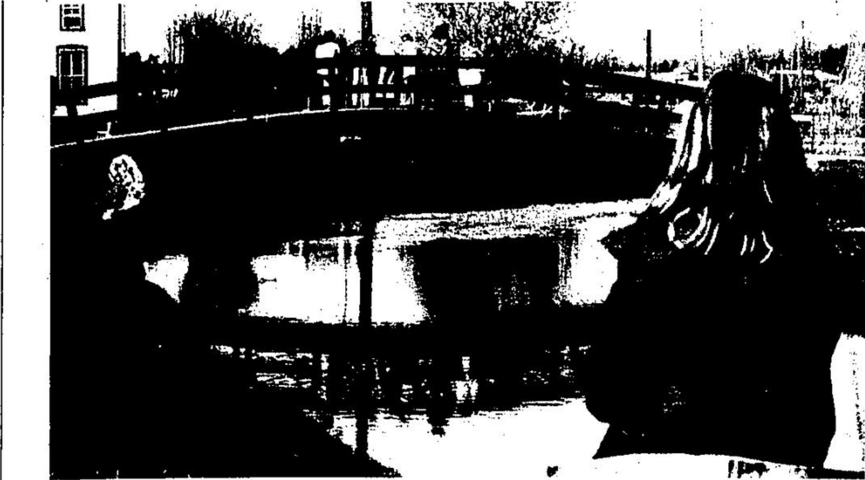
GAZING INTO a sea of tranquility is this group of youngsters on the arched library bridge. This quiet pool is presently a favorite spot for ducks, too. The creek is a beauty spot at all times of the year.

PRIVATE in Park area, Charming 2 storey older home among the trees. 3 bedrooms upstairs, 4 paneled rooms downstairs, many extras, $63,000. 877-6513.