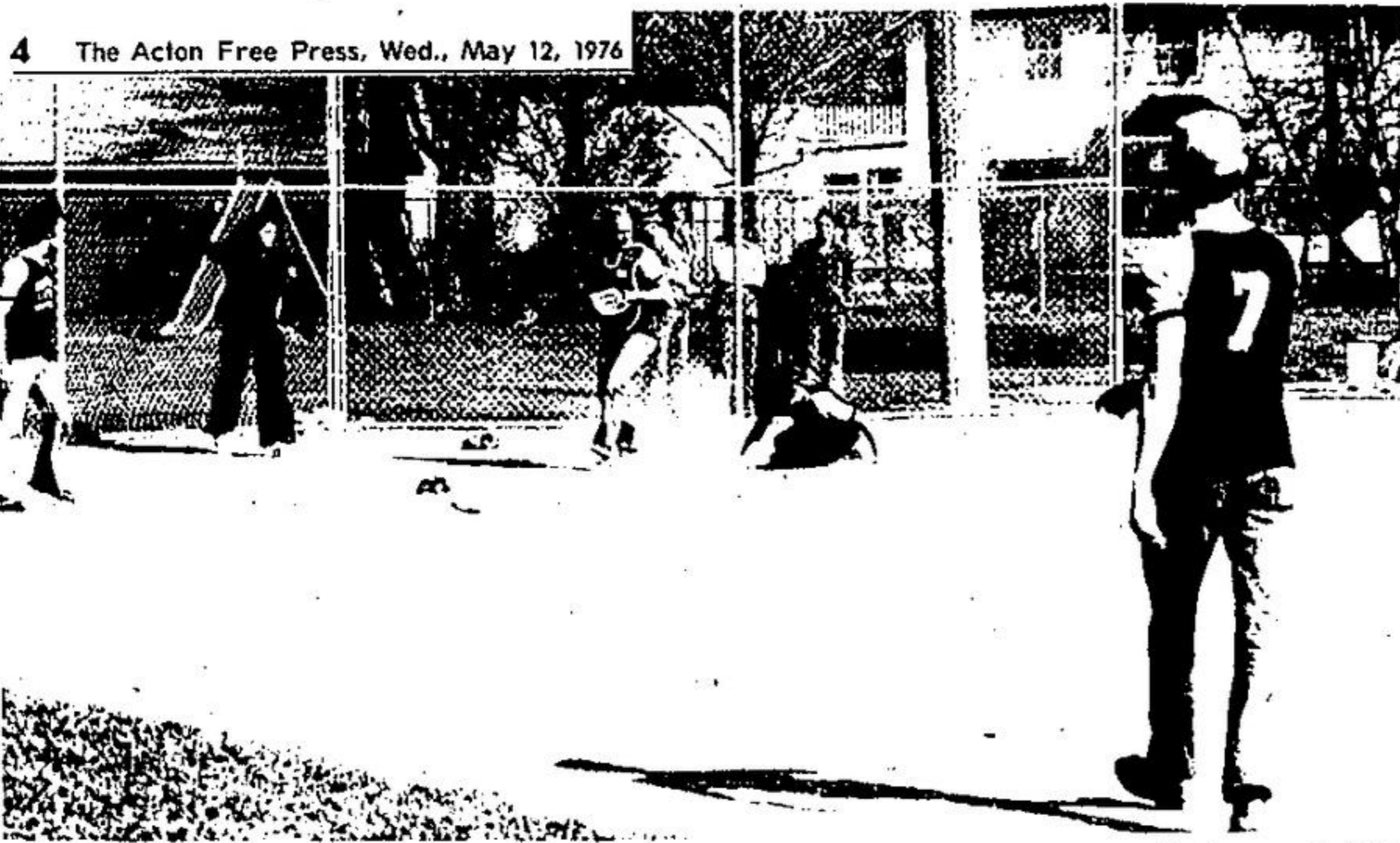
"YOU'RE OUT!" cries the umpire during the Acton Men's Softball Association season opener Sunday afternoon at the park. The six team league started the season with a trio of nip and tuck games which indicate a close season. Ledger's

IGA and Catering came out on the long end of 6-5 scores against Family Cleaners and Van's Welding respectively. Station and Electric tied five all.