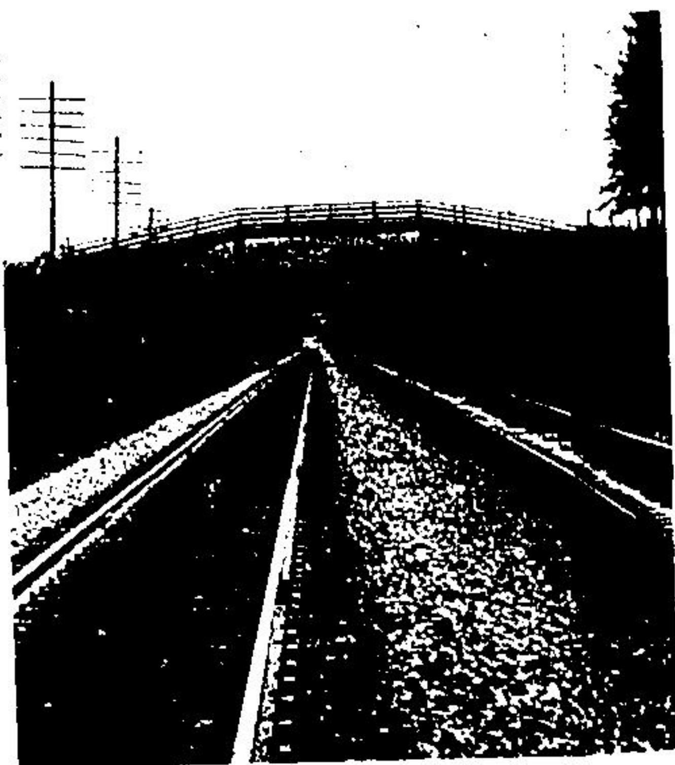
SMALL WOODEN bridges, like this one, near Campbellville allowed farm animals to cross to another field.