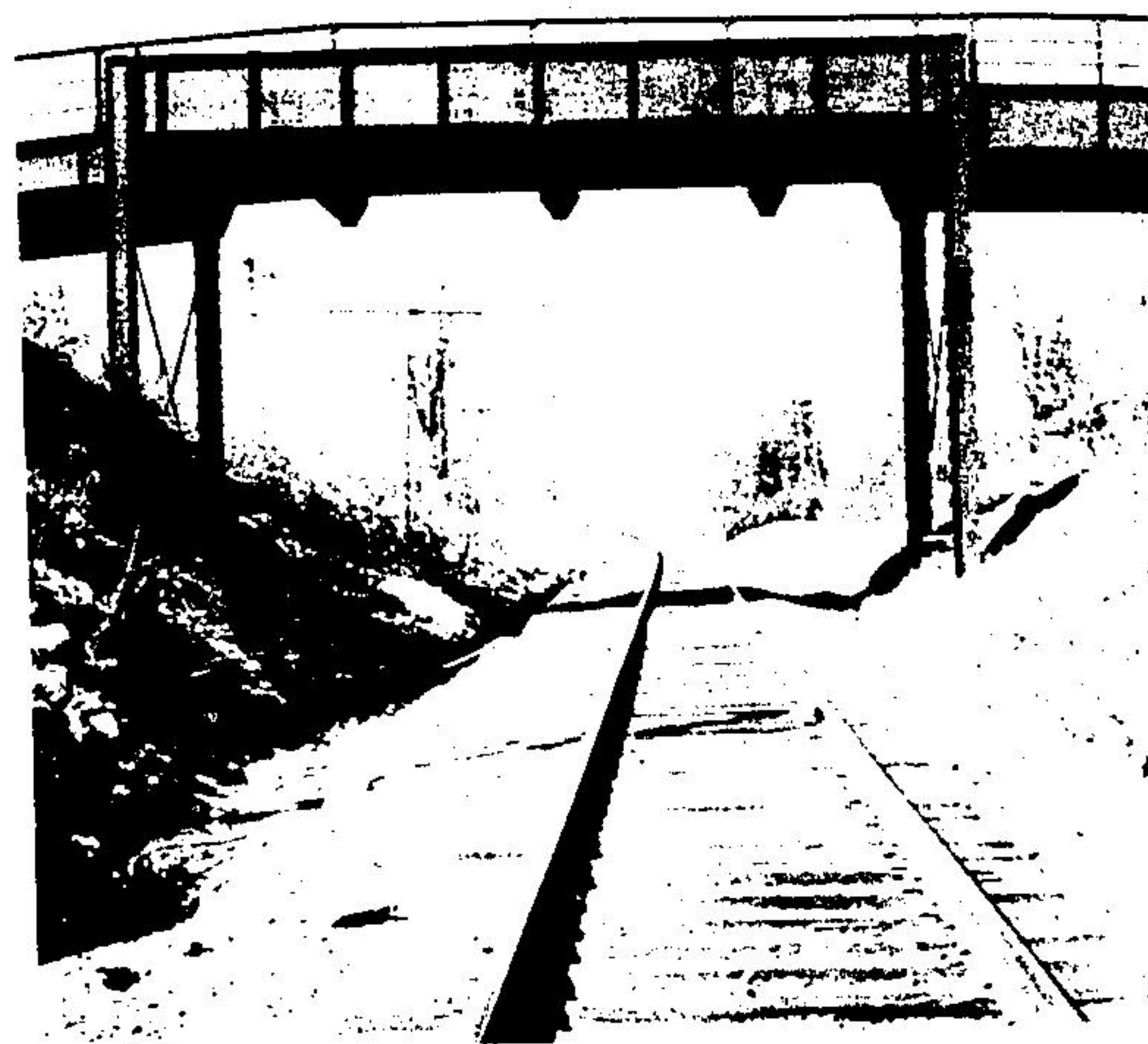
A STEEL bridge at Limehouse links the Fifth Line and 22 Sideroad.