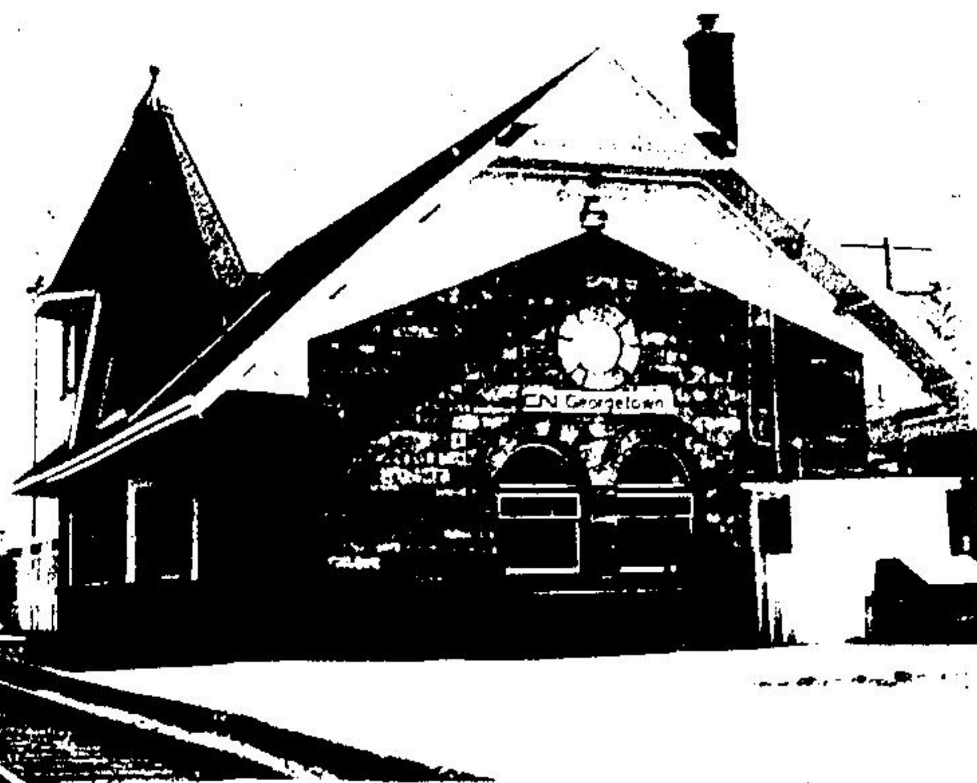
THE CNR station at Georgetown is the only one in the three towns, which remains open. Most of the passengers take the GO commuter train to Toronto.