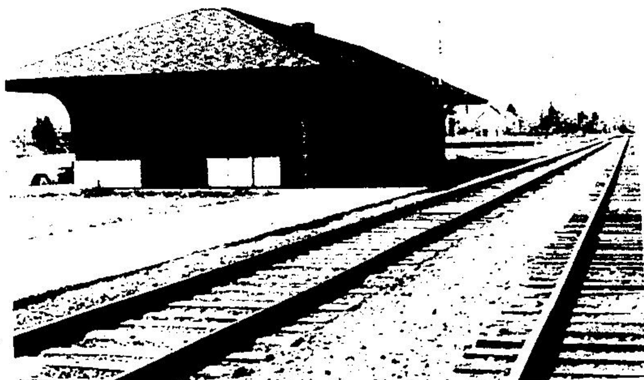
THE OLD CPR station in Milton is now rented out to a rubber sealant firm.