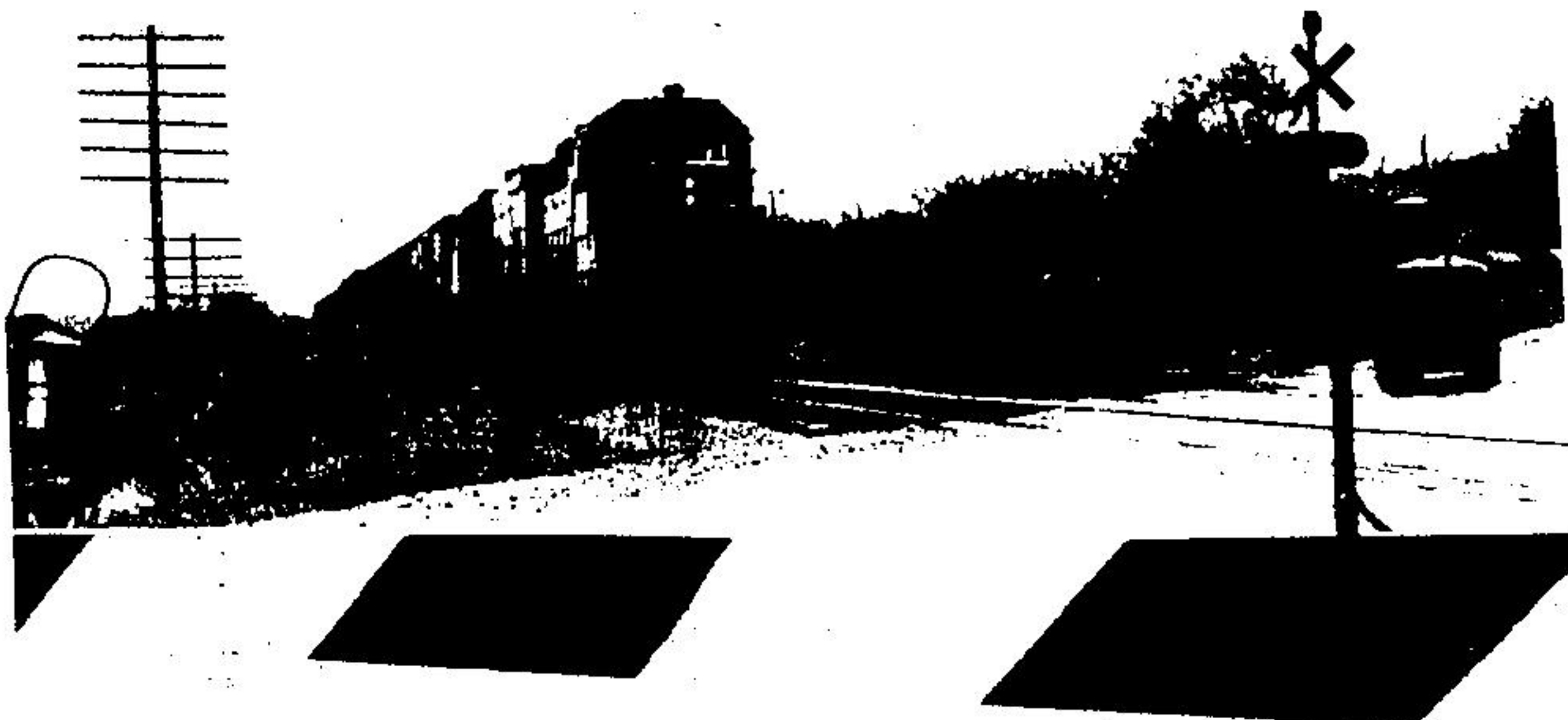
FREIGHT trains, hauled by diesels barrel across the CPR line, which pass through Milton, but seldom stop now.