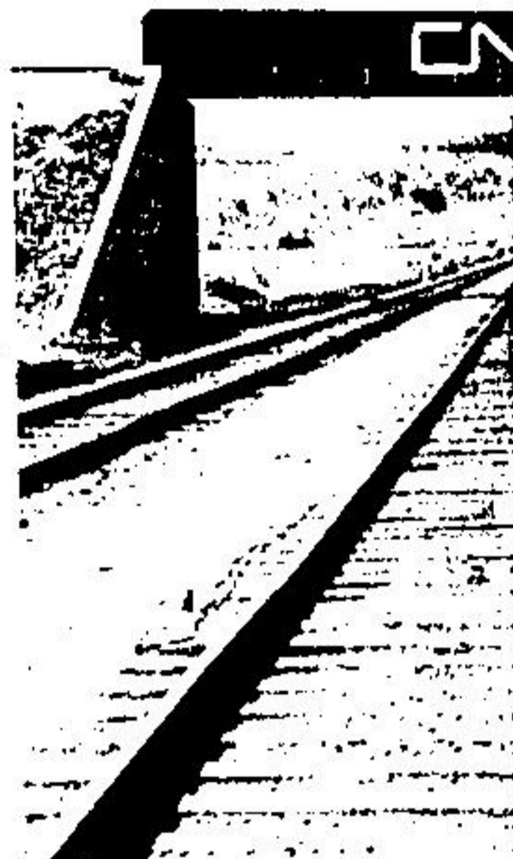
THE CNR line from Georg... crosses the CPR on the west...