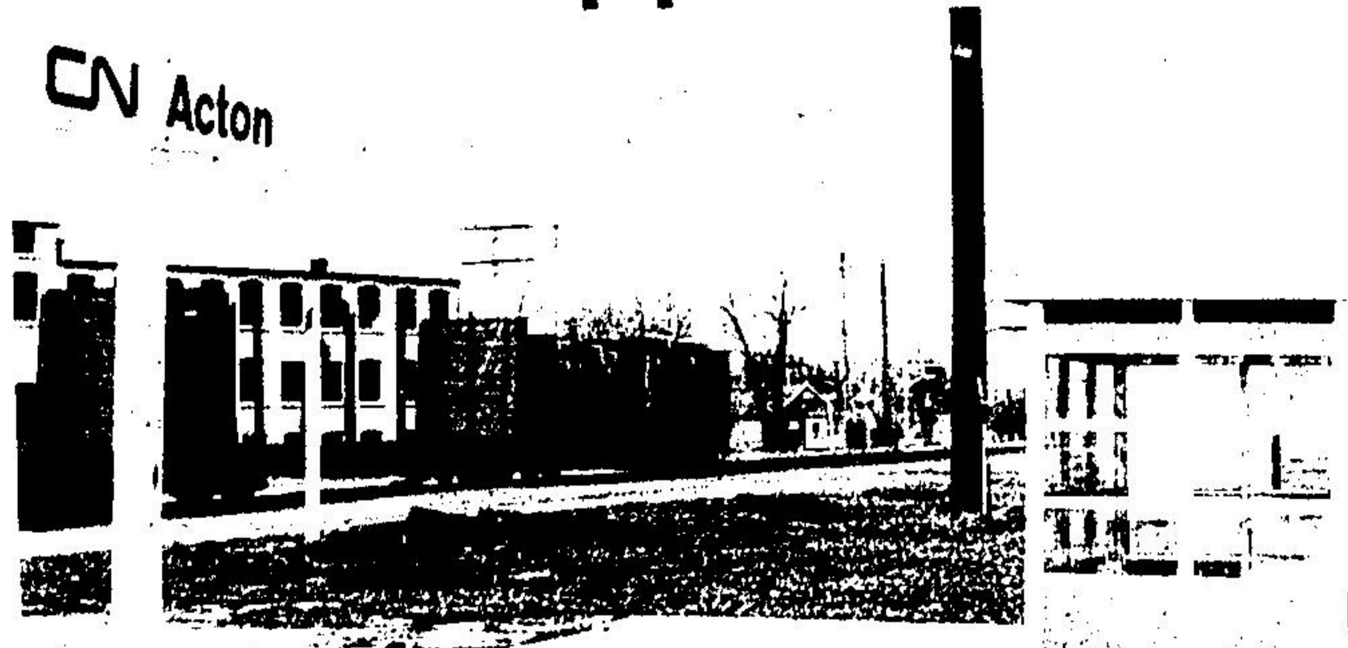
A GLASS CUBICLE AND THE SIGN "Acton" are all that remain where the Acton CNR station once stood.