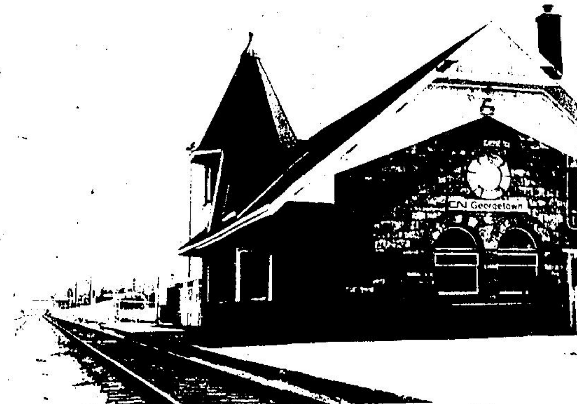
THE CNR station at Georgetown is the only one in the three towns, which remains open. Most of the passengers take the GO commuter train to Toronto.