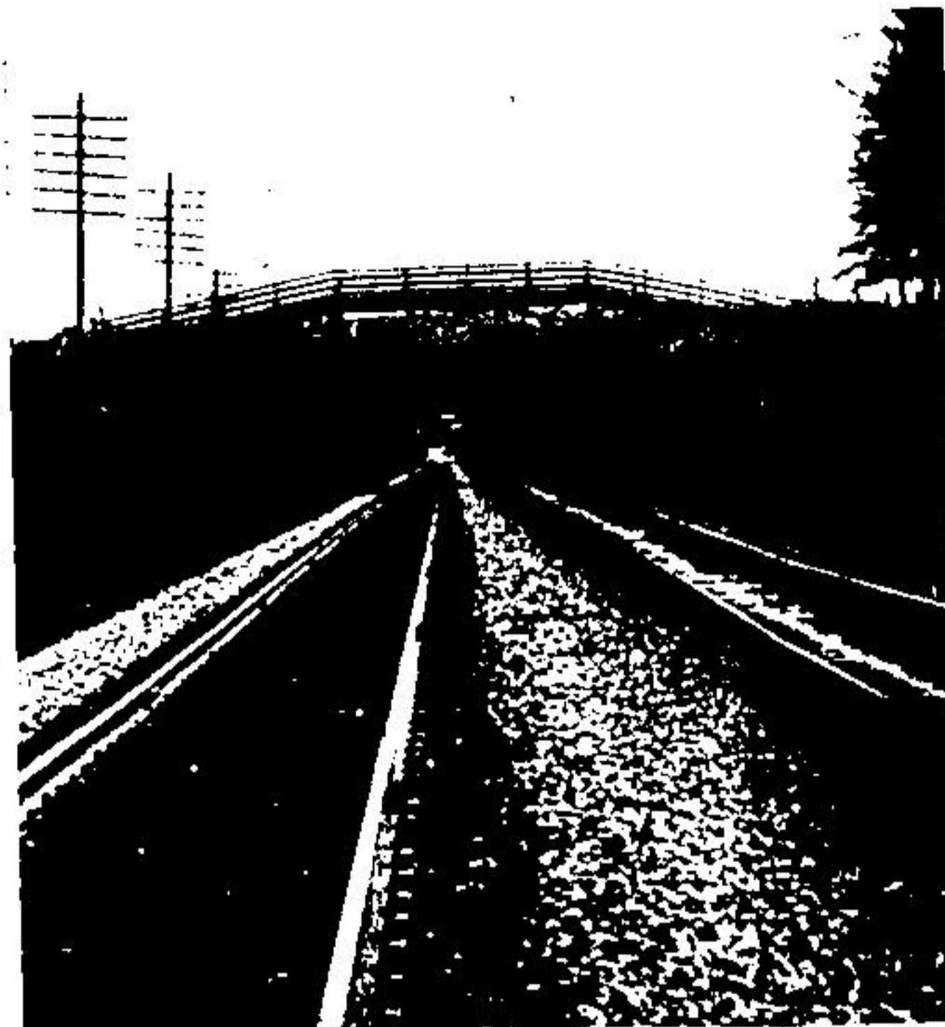
SMALL WOODEN bridges, like this one, near Campbellville allowed farm animals to cross to another field.

Passenger service on railways passing through North Halton was once a big business, but now most of the lines carry freight only. Some passenger trains still pass through, but in Milton and Acton it's no longer possible to catch a train to the city. Here's a look at North Halton's portion of CN and CP railways and some of their characteristics.