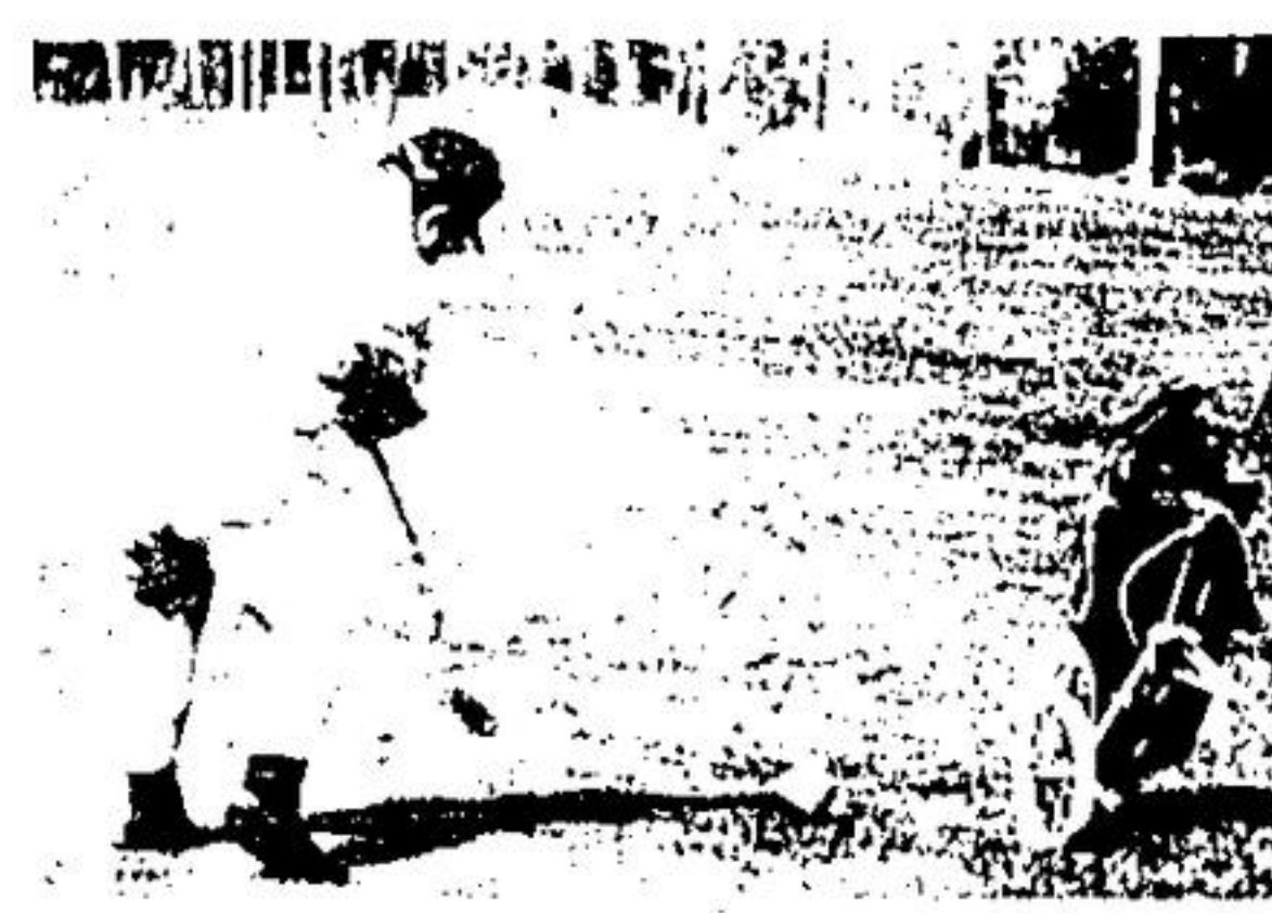
GOLFERS HAVE been out at Acton Meadows for three weeks now and another busy summer is underway.