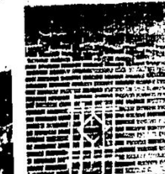
BLISTERED insul-brick is reminder of the fire that could have completely destroyed the Swanston home if not for the fast work of Rockwood Fire Department last weekend. The men watered down the house before any further damage resulted. The barn and horse barn were destroyed despite all effort of firefighters.