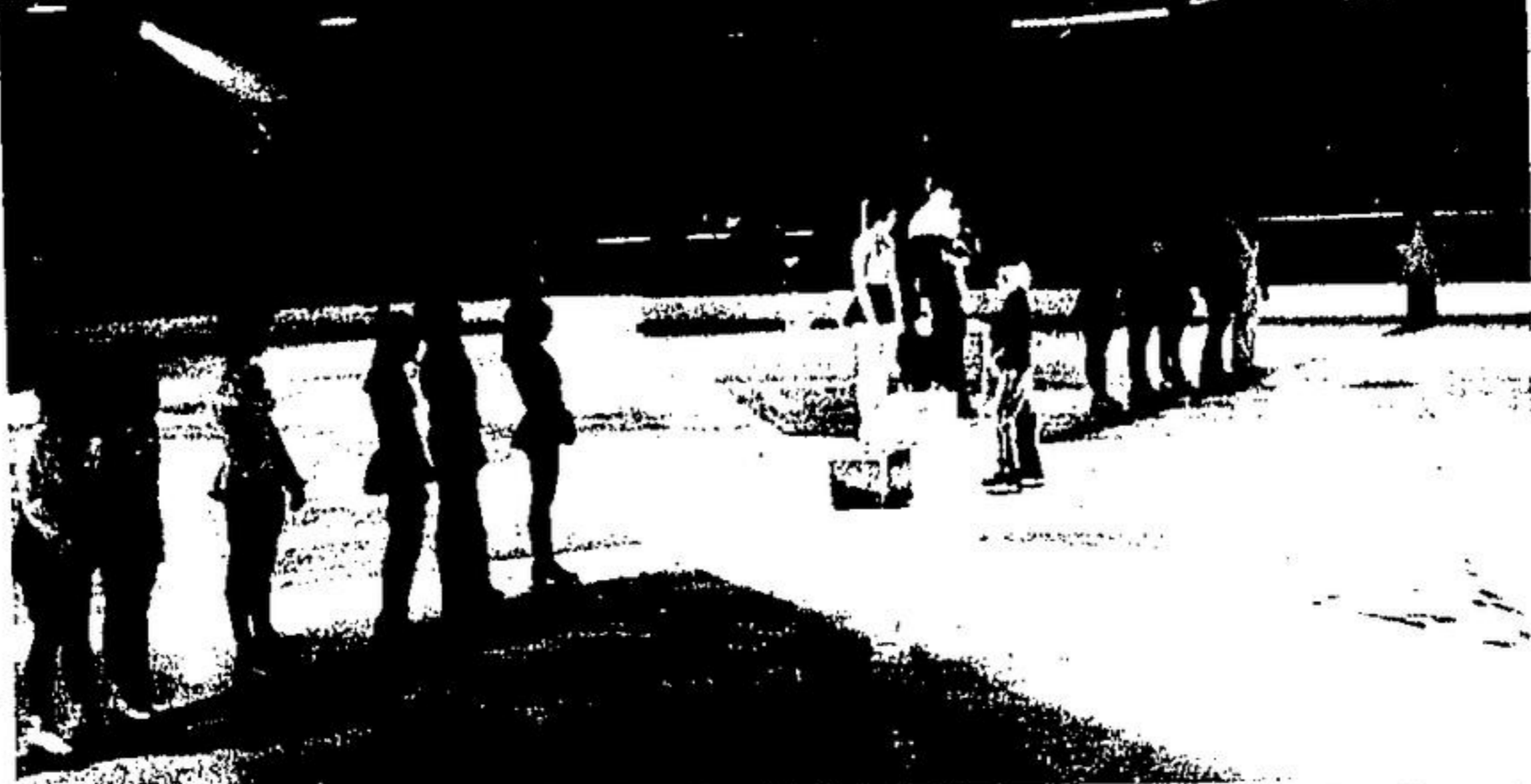
FIGURE SKATING CLUB members re-created the presentation of Olympic medals at the finale of the carnival Saturday. There were two performances, both to packed houses. Families and friends were delighted with the quality of the show and called it "the best ever."