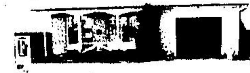
$66,900 —Big 1/2 acre in town. Quiet cul-de-sac, 4 bedrooms, family room. Buy clear or arrange suitable financing.