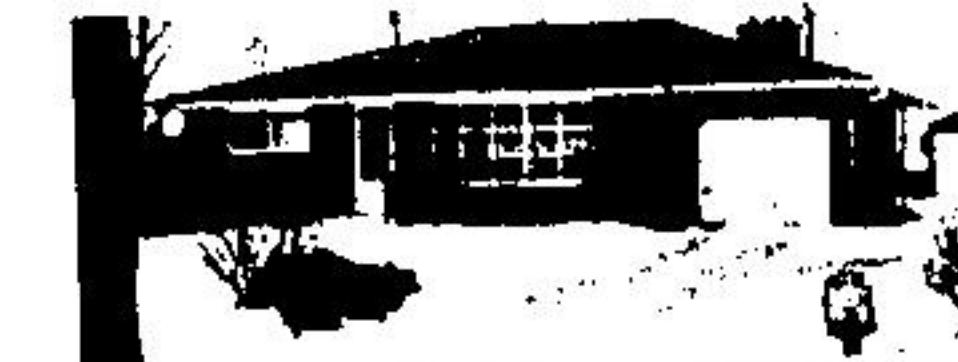
$75,900 —Across the fairway and a beautiful view it is! Fireplace in dining room with walkout to large lot. Additional detached garage or workshop. Consider any offer.