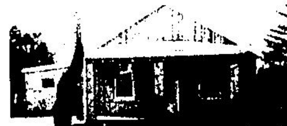
$44,900 —First come, first served. 3 bedrooms, large living room and everything's very neat. It's got to be the best deal in town today. So hurry.