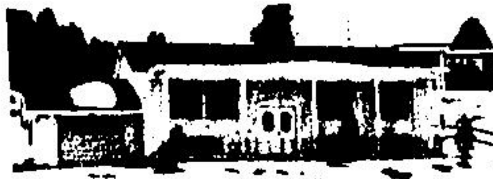
$87,500 —Southern Mansion in lovely Terra Cotta, custom built, large living room overlooking Credit River, 16 x 14 master bedroom. A home for people with good taste.

ACREAGE 52 acres of rolling land, heavily treed, flowing stream. Listed at $83,900.