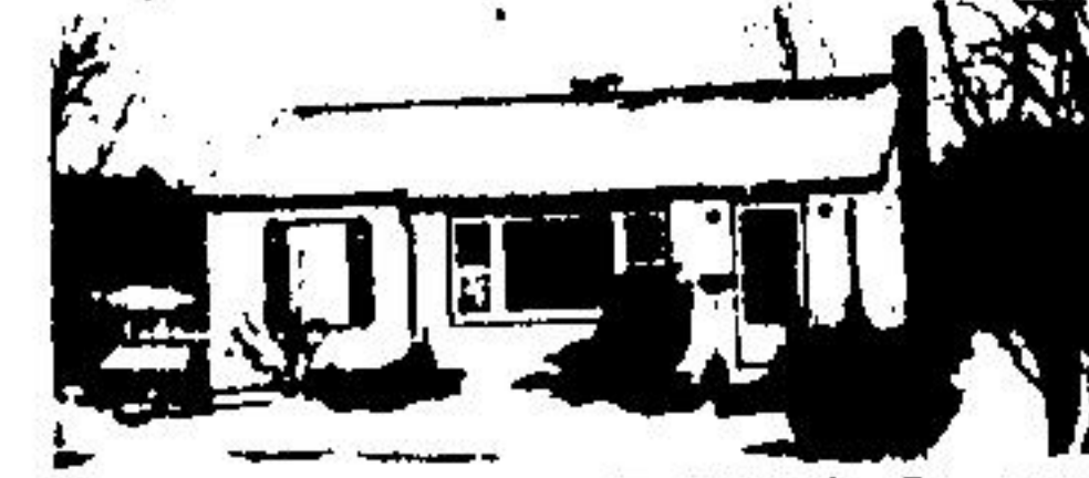
OVERLOOKING CREDIT RIVER —On paved road in Glen Williams. Cute 3 bedroom frame bungalow, full basement, new garage almost complete and look at the size of this lot—70 x 170. Put this on your list of MUSTS for $53,500.