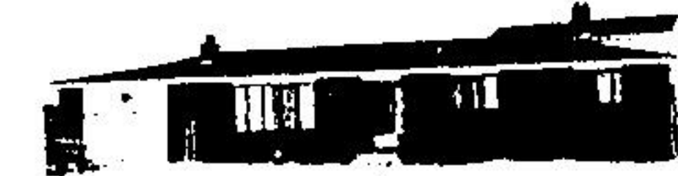
LARGE 3 bedroom home just south of Erin on paved road. Extra parking, 2 fireplaces, 2 baths, all rooms oversized, huge basement can be finished to suit your needs.