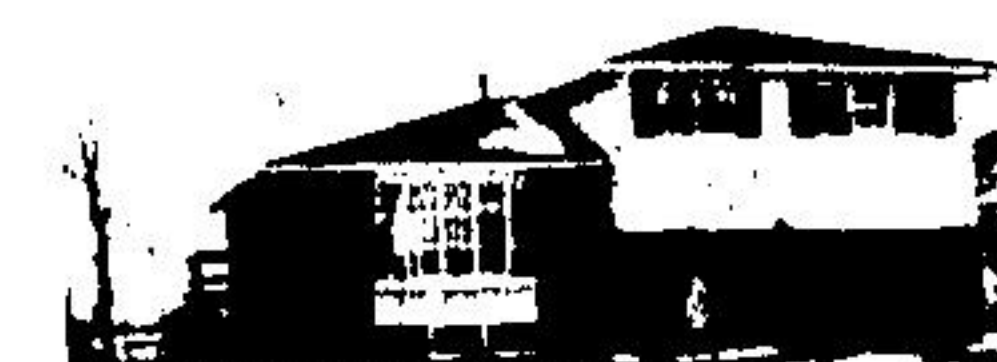
$69,900 —Four bedrooms up and family room on main floor, wet bar. Beautiful ravine setting and a ten mile view from cedar sundeck.