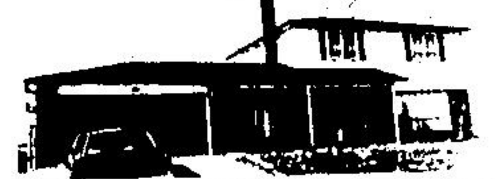
$84,900 —Just off Trafalgar Road, near 401, 3/4 acre, modern, 4 bedroom layout, family room, fireplace.