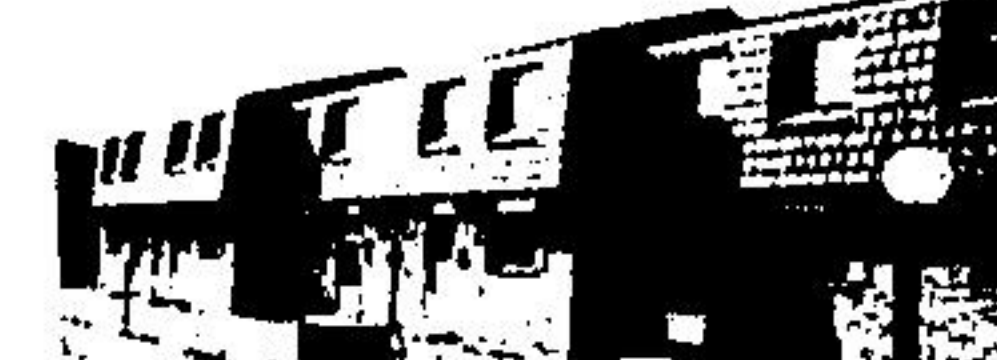
$42,900 —Pleasant surroundings, immaculate townhouse, fully broadloomed and less than $2,500 down may buy it. So why rent, try an offer.