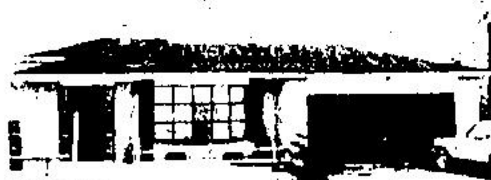
PEACEFUL ERIN —Large roomed backsplit, 3 years old, terrific shape and rec room is really something. Look again priced at only $57,500.