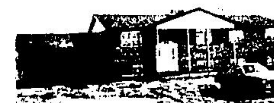
SEEING IS BELIEVING —Newly built for family with discerning taste, high quality workmanship, huge kitchen, family room, balcony with sensational view and other features that should be seen. Priced at $129,000.