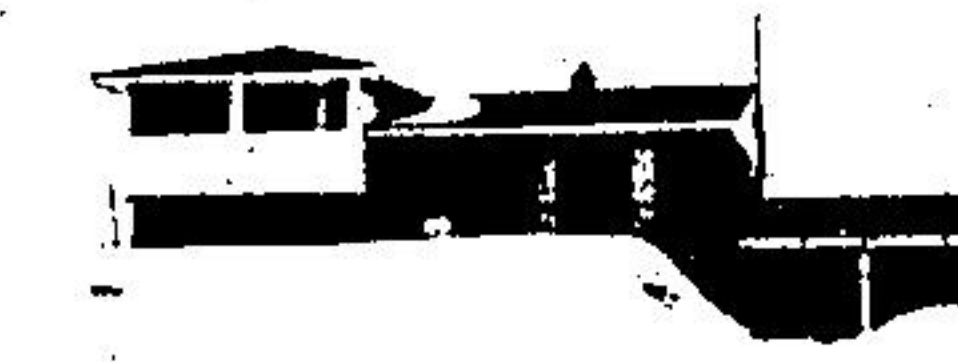
$66,900 —Hilltop country living near Erin. 4 bedroom home ideal for active family. 18 ft. living room, finished family room with fireplace and sliding patio doors. Terrific value at a low price.

ACREAGE 52 acres of rolling land, heavily treed, flowing stream. Listed at $83,900.