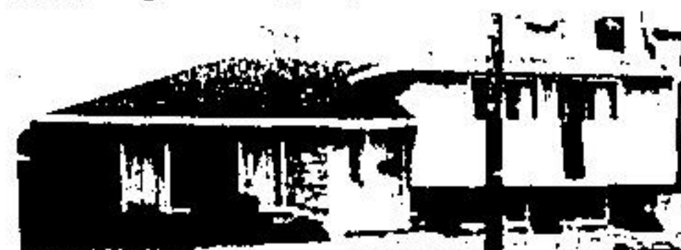
PARK AREA —Custom built and exceptional quality, 3 luxury size bedrooms, family room with raised hearth, separate dining room with walkout. A pleasure to show. Price $75,900.