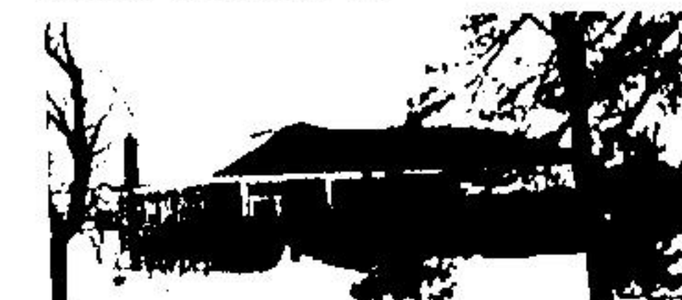
$84,900 —1 3/4 acre lot, shrubbed and treed, 3 minutes from town, 1,450 sq. ft. living space, 40 ft. dug well—very desirable property for country living.