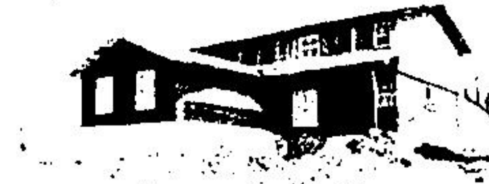
73 ACRES with 3,400 sq. ft. home under construction by custom builder. 400 ft. family room, den, 4 bedrooms, central stair well. Choice broadloom colours, etc. Ideal horse farm property. 10 minutes from Georgetown. Asking $185,000.