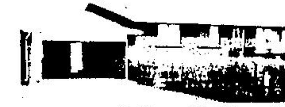
$64,500 —8 year old "like new" brick bungalow on big 1/2 acre lot. Living-dining room, beautiful kitchen, double garage and numerous extra features.