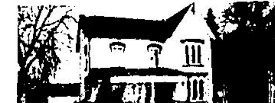
$86,900 —Gracious 80 year old solid brick beautiful condition, 2 large verandas, stone fireplace in 24 x 14 living room.