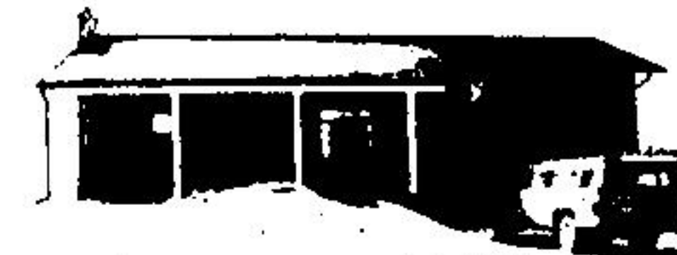
RARE COMBINATION —Super 2 acre lot, soft flowing stream, little waterfalls, pond AND brand new home, 3 bedrooms, oversize garage. Superb workmanship throughout. We'll be proud to show you.