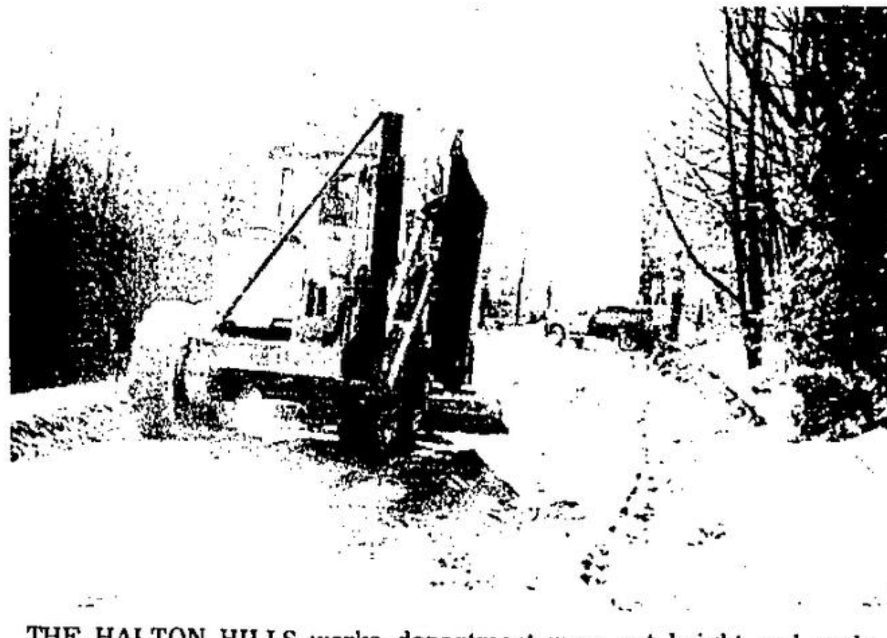
THE HALTON HILLS works department were out bright and early Thursday morning scraping down the fourth line road.

The Interested Citizens Group feels it has the support of 4,000 people along the proposed Bradley to Georgetown corridor, including many in Halton Hills, Erin township and parts of Milton.