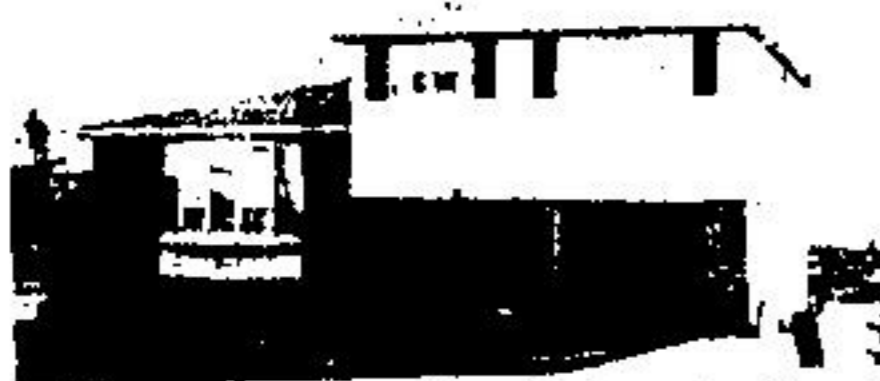
$69,900. Four bedrooms, main floor family room with wet bar, beautiful ravine setting. A super home reasonably priced.