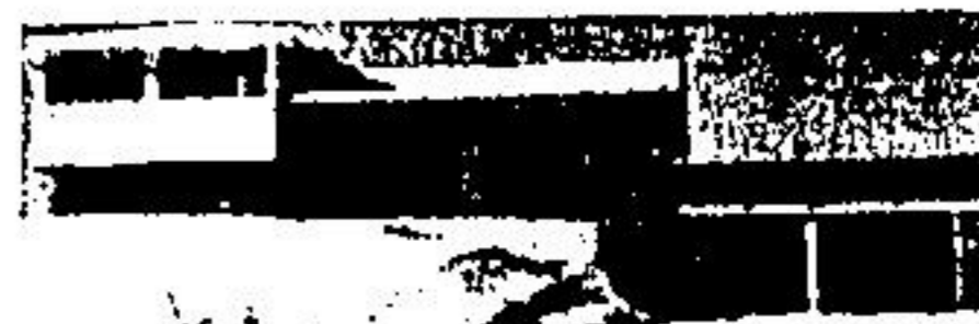
$69,900. Hilltop country living near Erin. 4 bedroom home ideal for active family, 18 ft. living room, finished family room with fireplace and sliding patio doors. Terrific value at a low price.