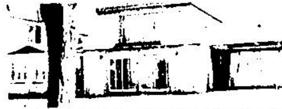
$74,900. Park District—Spacious modern design, huge master bedroom, open staircase, 2 double door walkouts.