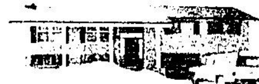
$110,000. Professionally built spanking new and waiting for eager buyer, 2 ACRES, ponds, trees and all modern features.