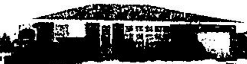
$75,900. Across the fairway and a beautiful view it is! Fireplace in dining room with walkout to large lot. Additional detached garage or workshop. Consider any reasonable offer.