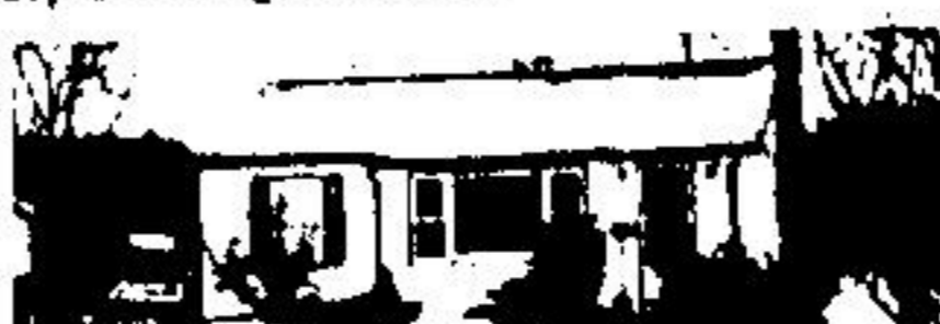
$53,500. Ideal starter home on big lot in the 'Glen' 3 bedrooms, large panelled living room, good first mortgage. Won't last at this low price.