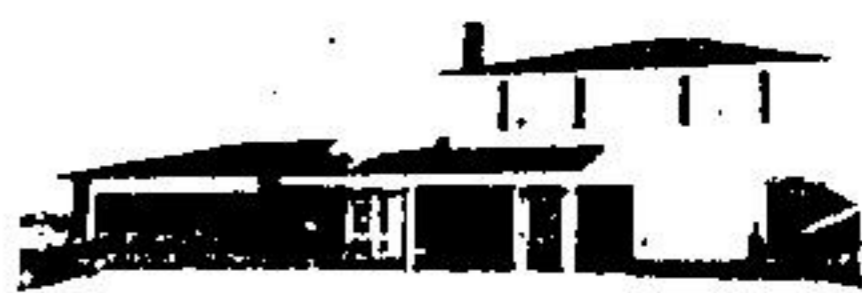
$84,900. Just off Trafalgar Road, near 401, 1/2 acre, modern, 4 bedroom layout, family room, fireplace.