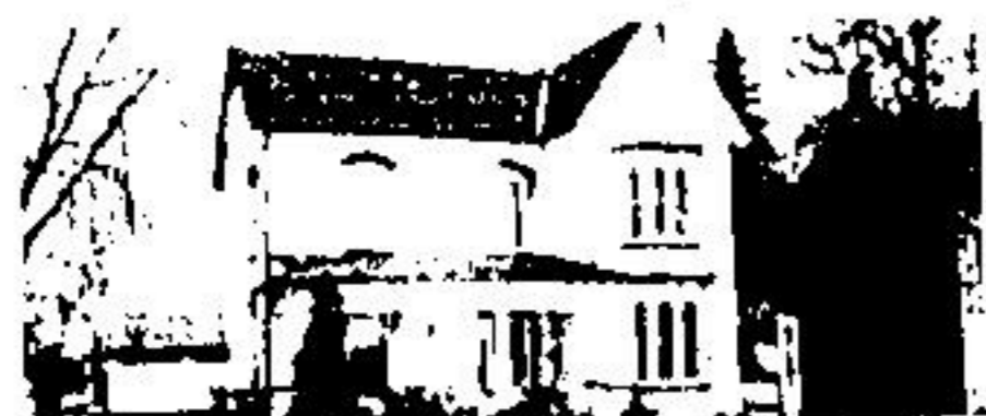
$86,900. Gracious 80 year old solid brick beautiful condition, 2 large verandas stone fireplace in 24x14 living room.