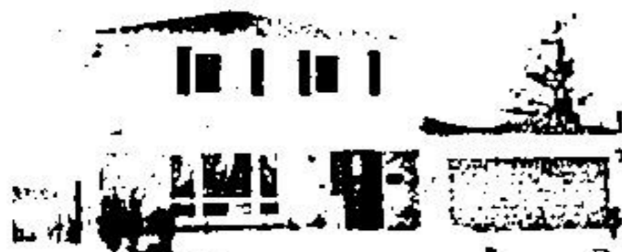
$73,900. Large cedar deck, gorgeous ravine lot, 4 bedrooms, excellent 9 1/4 percent mortgage. See it now!