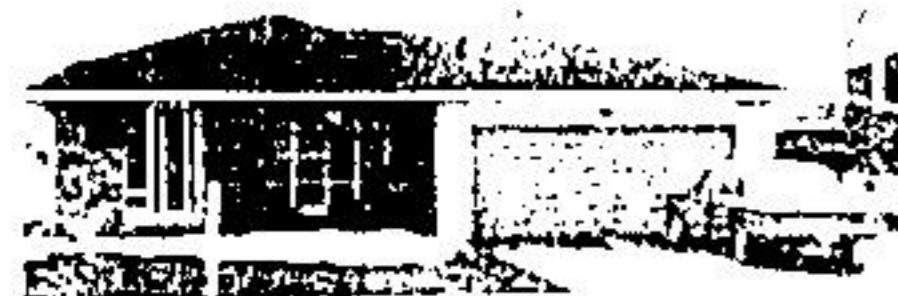
$74,900. Popular Avon model 'see thru' to family room. Fireplace, inground pool. Quiet cul-de-sac.