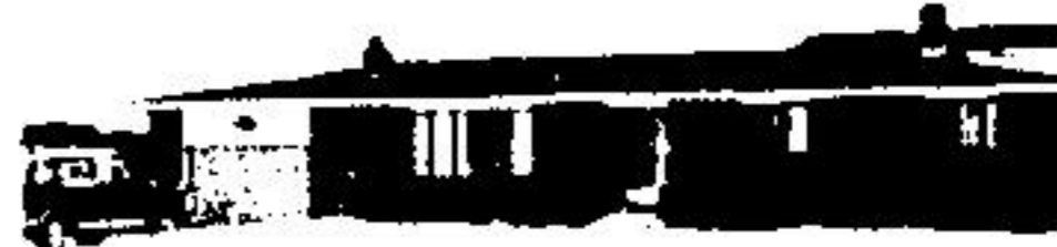
$77,900. Large 3 bedroom home just south of Erin, on paved road, 2 fireplaces, 2 baths, all rooms oversized plus huge basement.