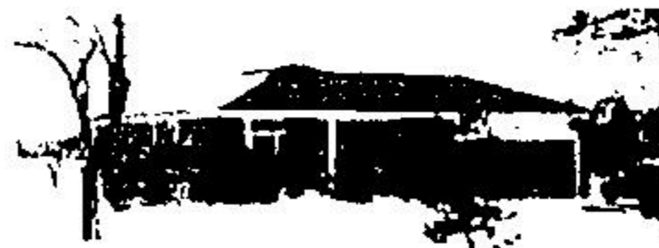
$84,900. 1 1/4 acre lot, shrubbed and treed, 3 minutes from town, 1,450 sq. ft. living space, 40 ft. dug well—very desirable property for retired couple.