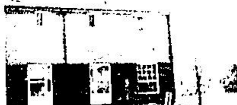
$43,500. Buying beats renting! Almost new town house improved model with walkout and 2 bath rooms.