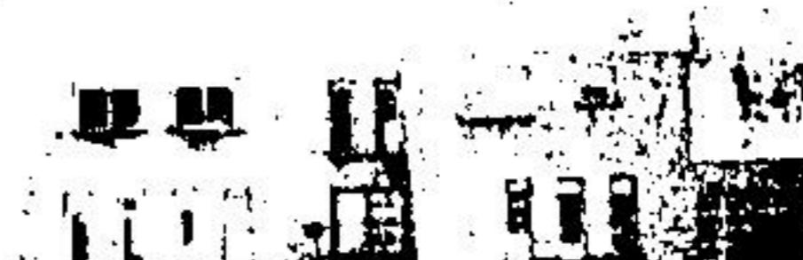
$159,000. Extraordinary! Riverside treed lot, indoor heated pool winding staircase and features too numerous to mention. Come have a look, it's in a class by itself.