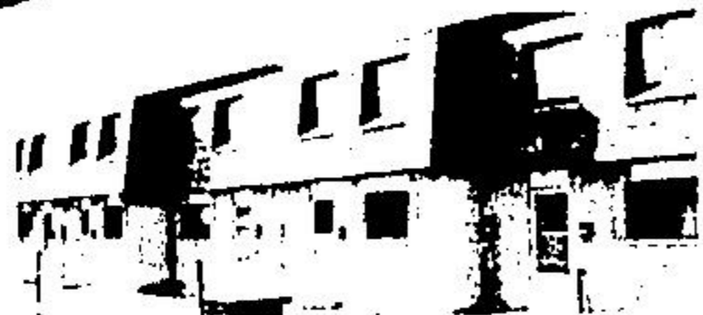
$42,900. Less than $2,500 down may buy!!! Broadloom throughout. Immaculate.