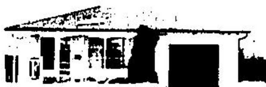
$66,900. 1/2 acre cul-de-sac lot, 4 bedrooms, family room. Buy clear or arrange new mortgage. June possession.