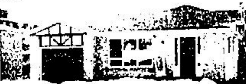
$59,900. In Milton—Builder's last home in new subdivision. Brand new backspill.