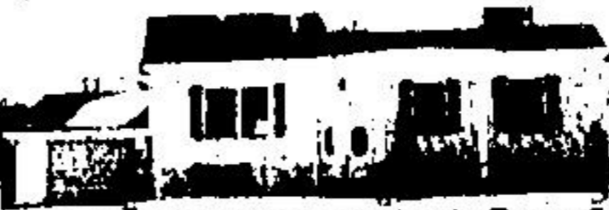
$87,500. Southern Mansion in lovely Terra Cotta, custom built, large living room overlooking Credit River, 16x14 master bedroom. A home for people with good taste.