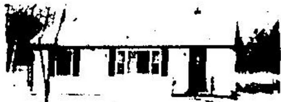
$47,900. 3 bedrooms, deep lot, ideal for gardening. Newly listed. It'll go fast!!