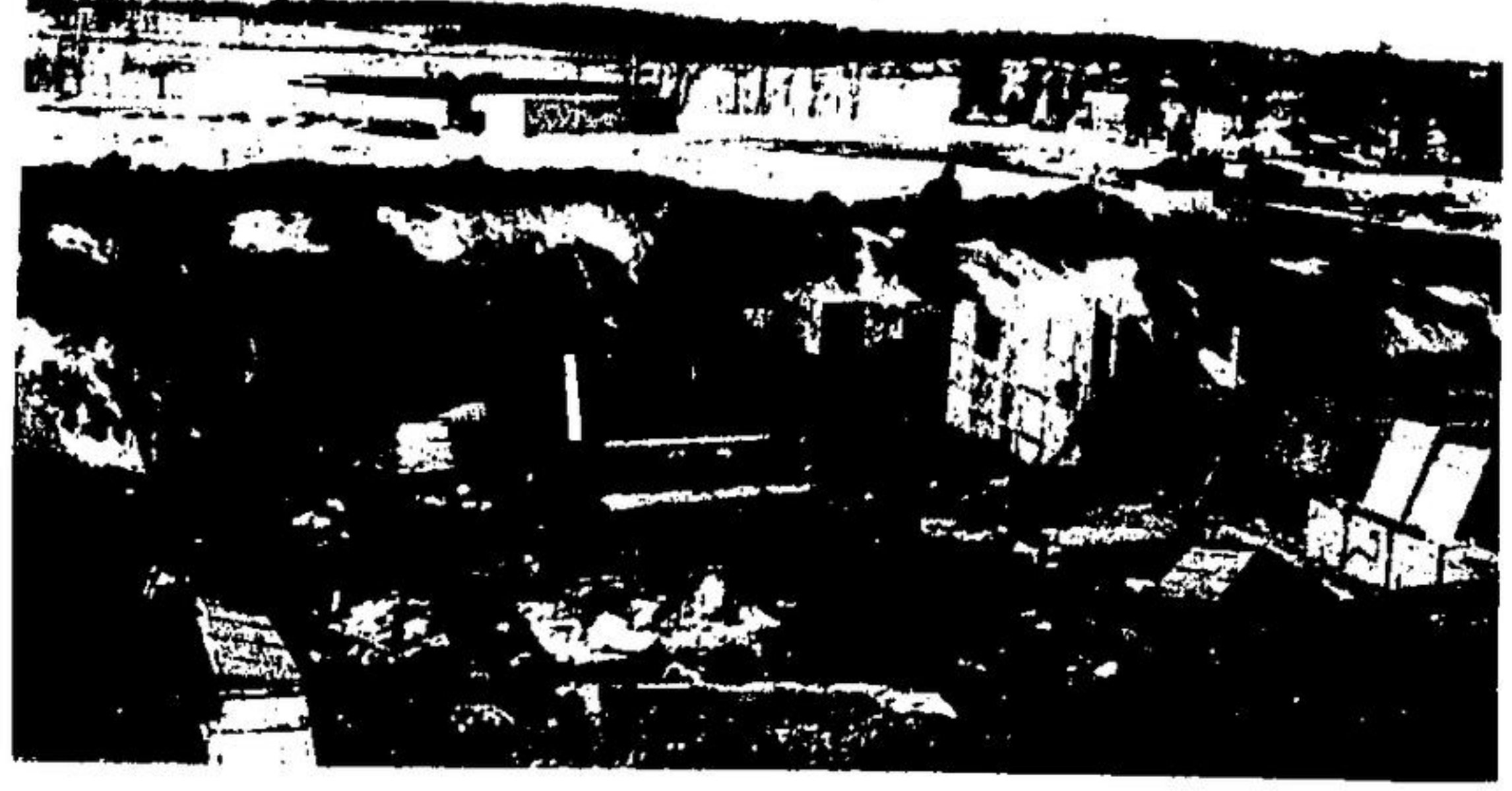
THE FIRST of the 29 homes to be built in the new Legion subdivision are in the early stages of construction as the concrete foundations were laid early this week.