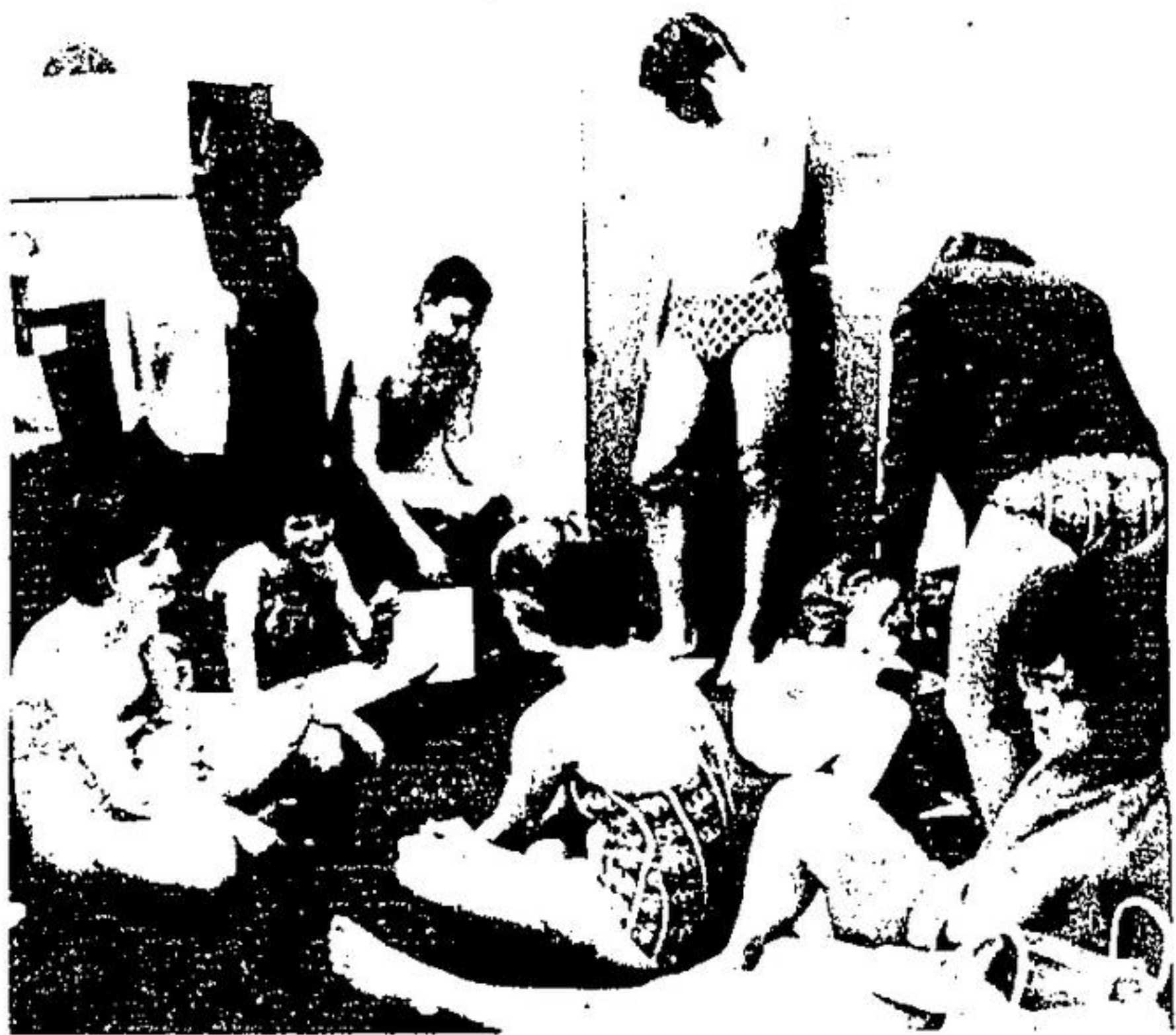
MEMBERS OF THE ACTON High School swim team relax between races at the Halton County final competitions at the Lord Elgin pool.