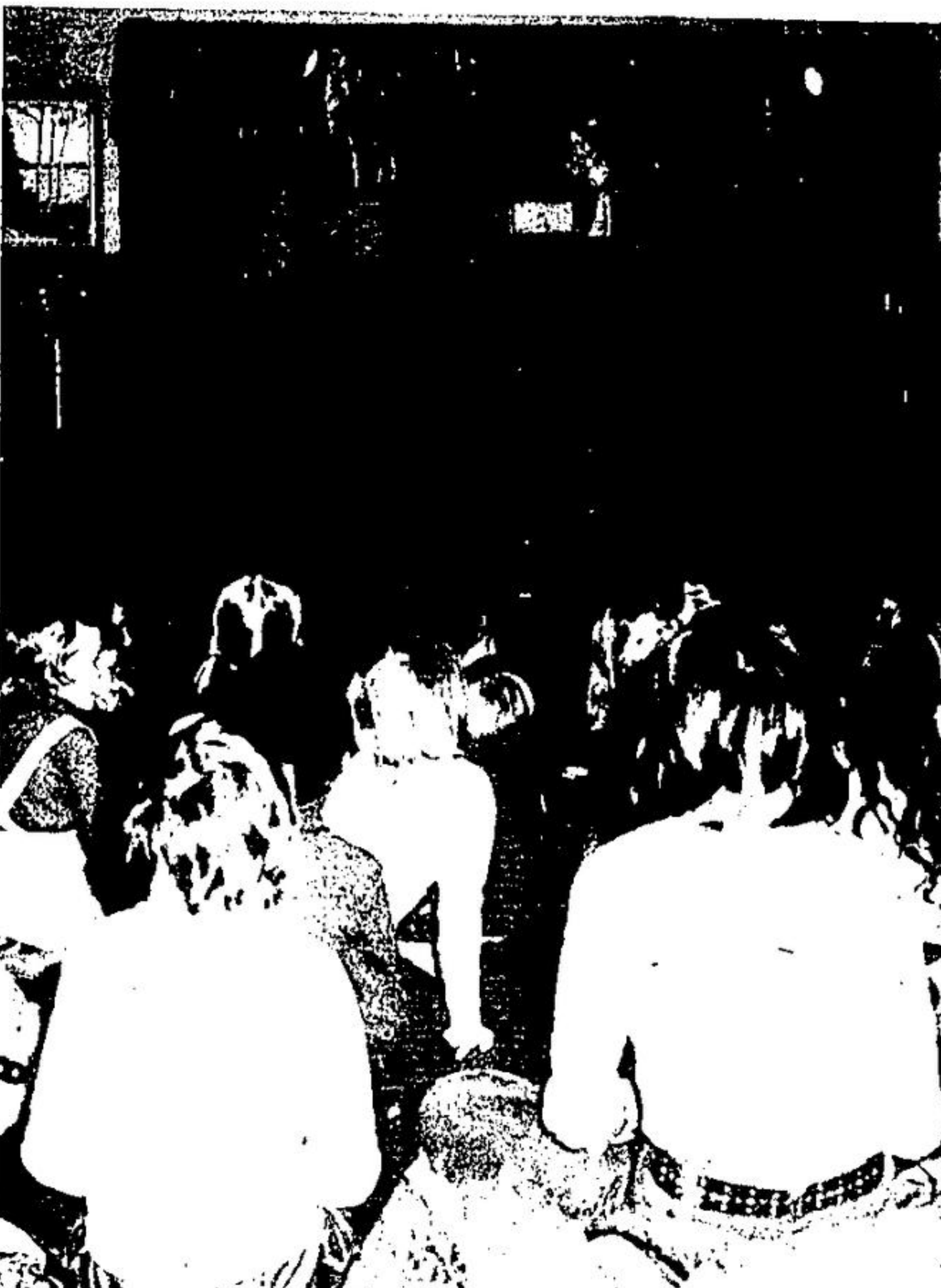
ABOUT 95 CHILDREN were thrilled by the puppet show The Friendly Puppet in the library board room on Saturday. The 35-minute presentation is put on by professionals who tour libraries, their home base in Weston. There's no direct cost to the local library.