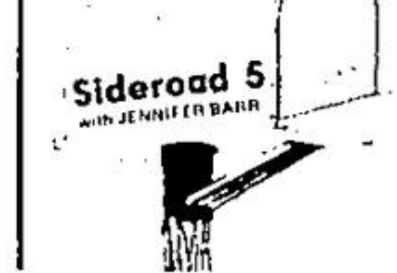
A few weeks ago I was reminiscing about Ottawa Valley winters - I must have jinxed something because we're having one right now in southern Ontario!

How's the snow up your way? Most of the Acton quota is in our front paddock making riding impossible even for the hardest of our Girls.