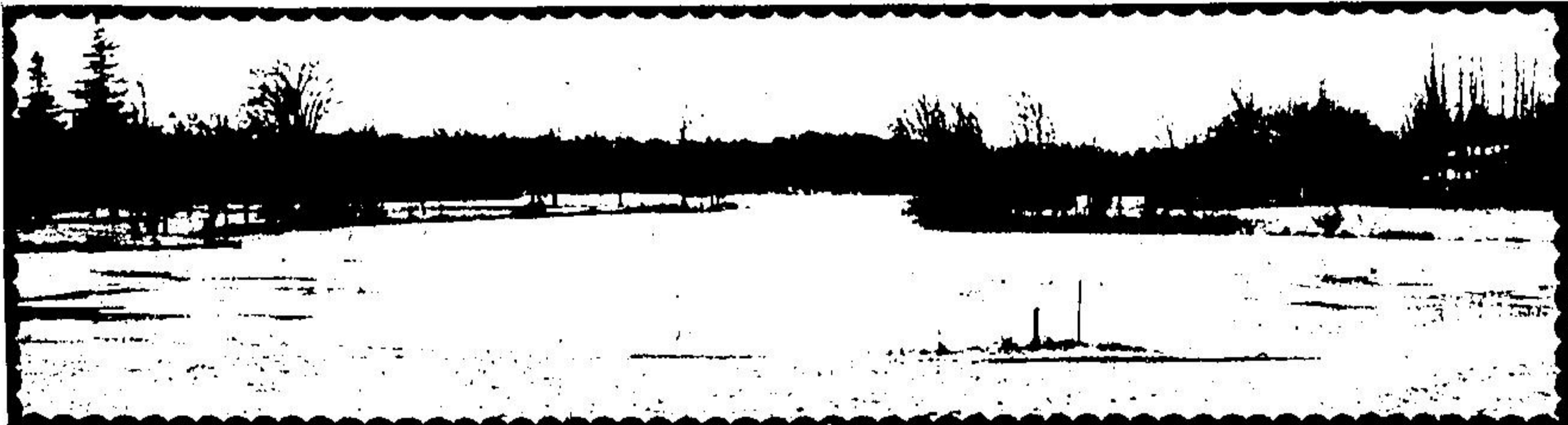
The water has become solid and the banks have turned white at the Acton Fairy Lake.