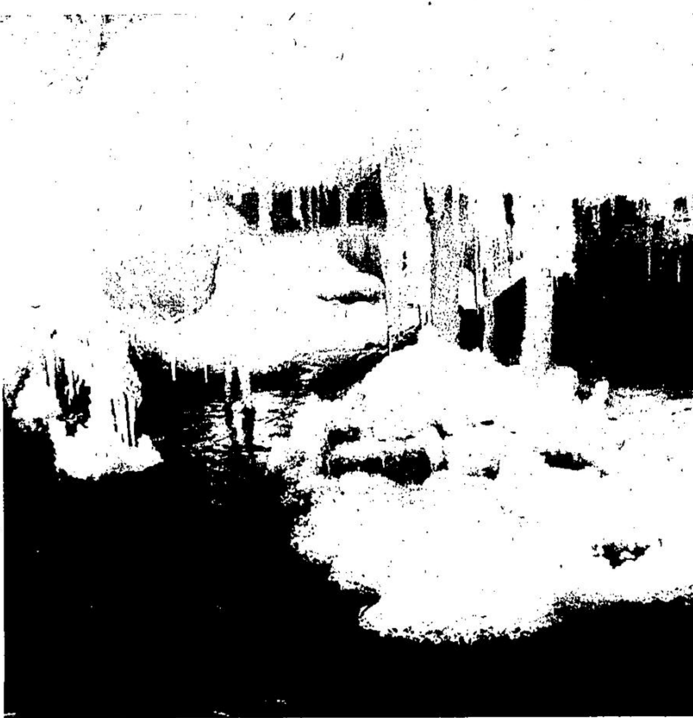
EVER-CHANGING work of art... ice formations at the falls on the Eramosa River. Ice melts and refreezes all winter long, luring camera fans.

It is the Lions Club hope that, through such co-operative effort, the community centre will be completed, thus providing a headquarters for even more charitable and community projects as well as a centre which will be a worthwhile facility for both children and adults of the district.