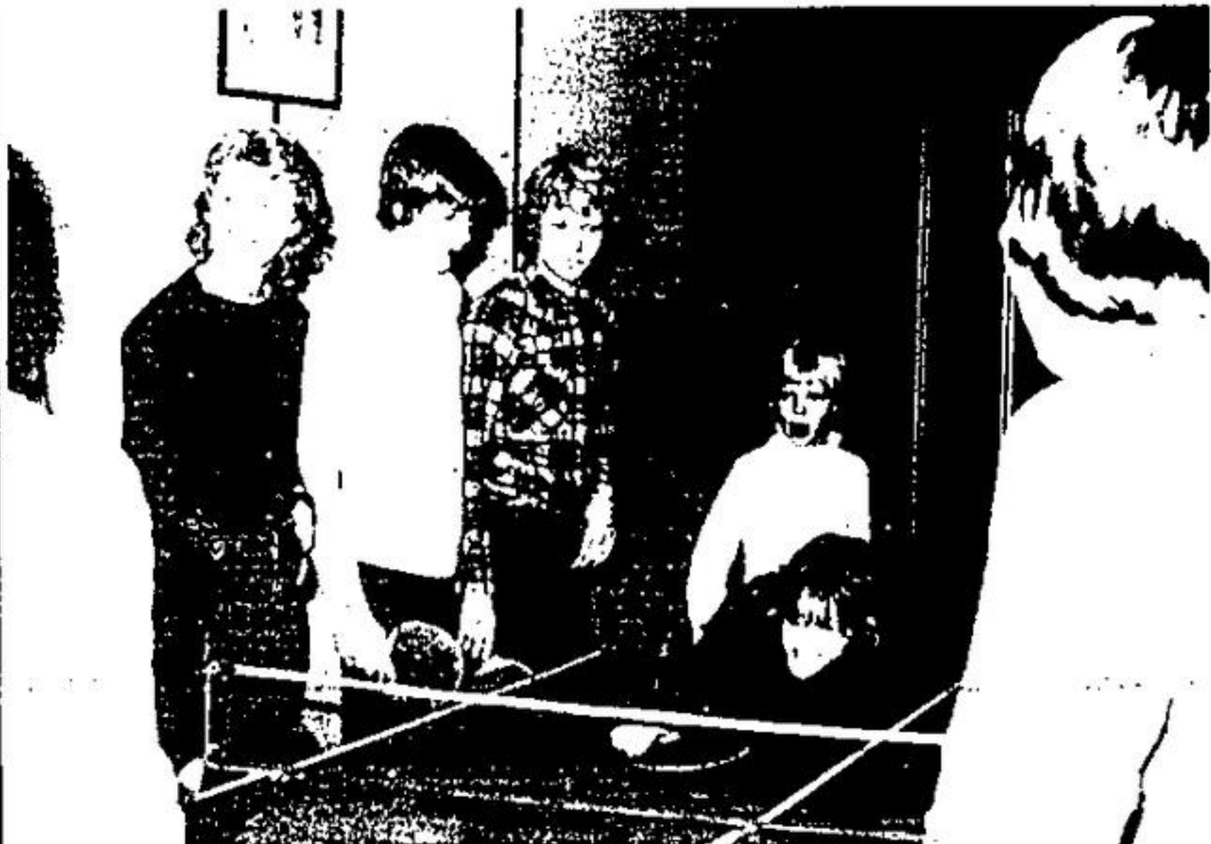
SWEDISH PLAYERS CELEBRATE their first win in five games during their tour in Ontario. The Vallentuna players are relaxing with a game of ping pong before dinner at the Legion.

Second Section ACTON, ONTARIO, WEDNESDAY, JANUARY 7, 1976 One Hundred and First Year—No. 27