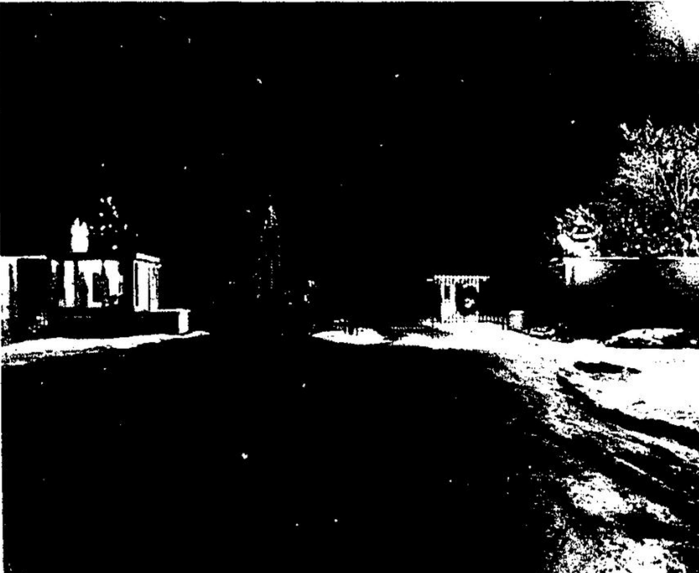
BEARDMORE GATES are always a tempting subject for photographers at Christmas-time. This shot was taken by Bob Dyc at night.