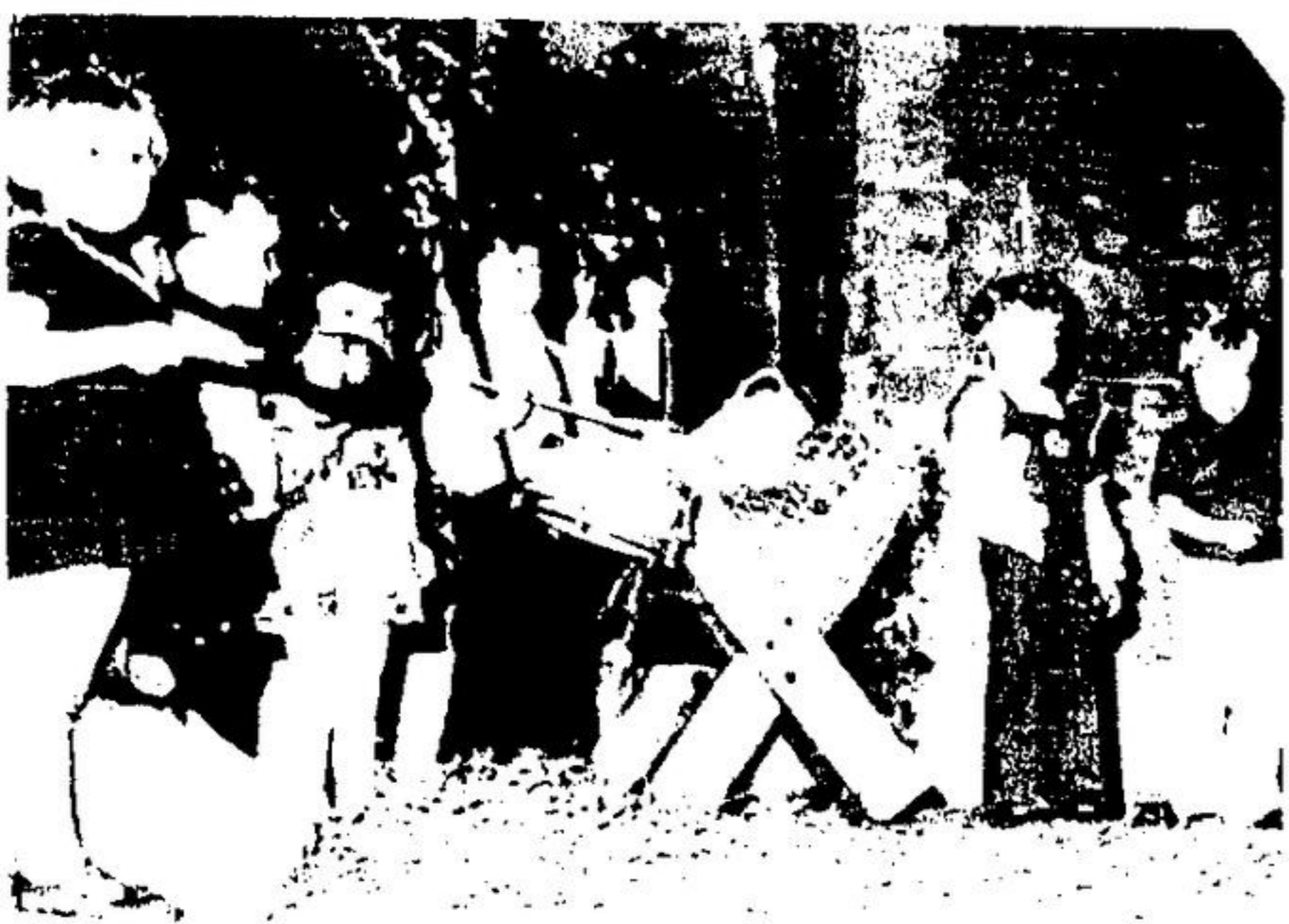
TINGING, DRUMMING, RINGING themselves into the Christmas spirit youngsters at the St. Alban's Christmas concert entertain an appreciative audience with seasonal music.