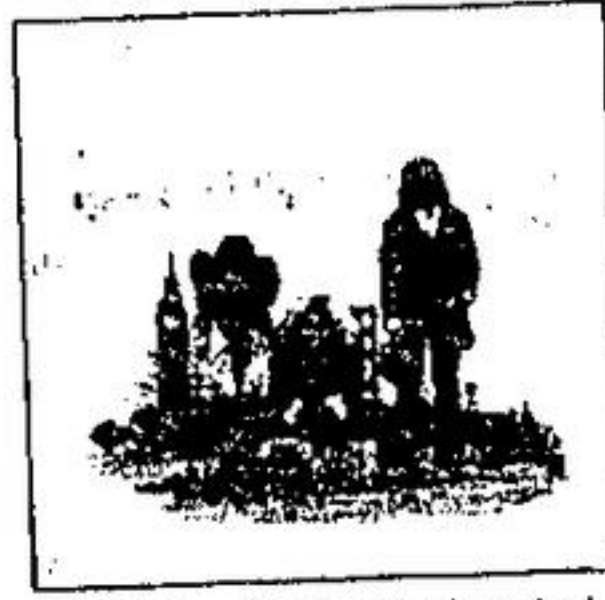
History - America's Greatest Hits by America with Horse With No Name, Ventura Highway, Muskatt Love and more!