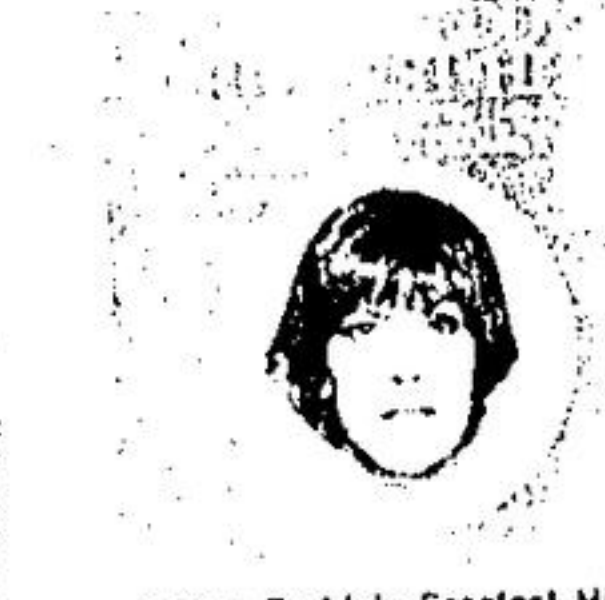
Helen Reddy's Greatest Hits with I Am Woman, Delta Dawn, Ain't No Way To Treat A Lady, and more!