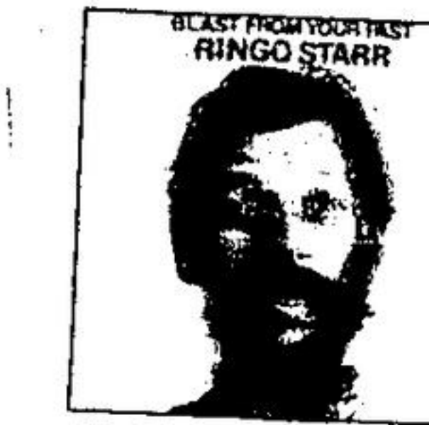
Blast From Your Past by Ringo Starr with You're So Beautiful, Don't Come Easy, Beautiful Blue Eyes and others!