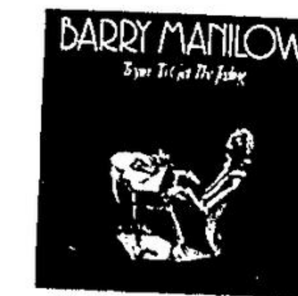
Tryin' To Get The Feeling by Barry Manilow with New York City Rhythm, Why Don't We Get Together, Beautiful Music and more!