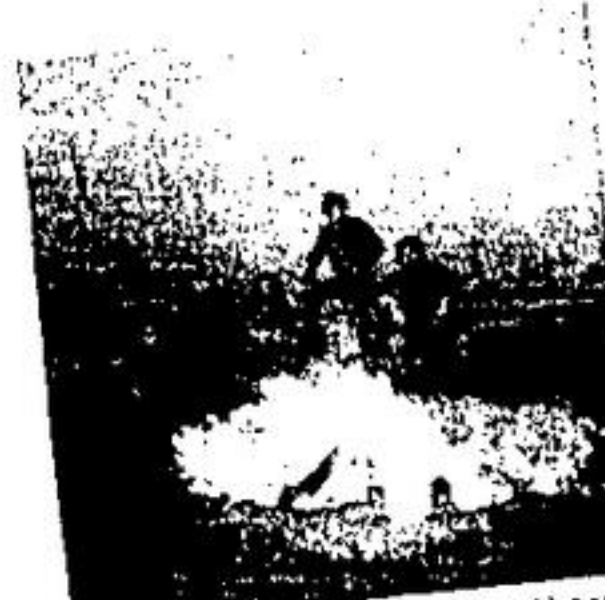
Northern Lights - Southern Cross by The Band with Ragged Doves, Acadian Driftwood, Ophelia and more!