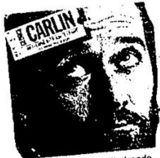
An Evening with Wally London... by George Carlin with 14 great monologues!