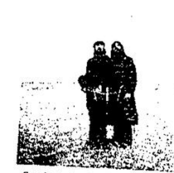
Seals & Crofts' Greatest Hits with We May Never Pass This Way Again, King Of Nothing, Summer Breeze and more!