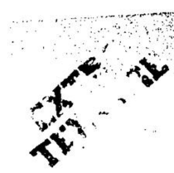
Extra Texture by George Harrison with You, World Of Stone, Grey Cloudy Lies and more!