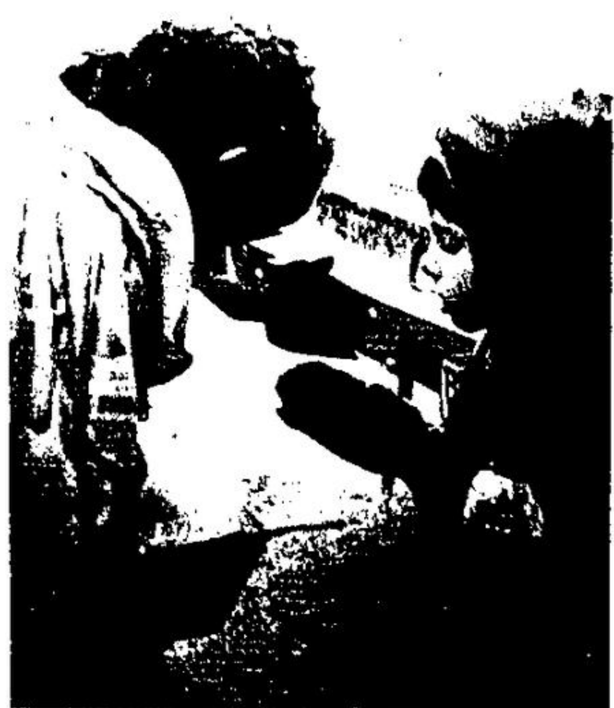
BUNDLED UP TO keep warm from the freezing rain during Saturday's Santa Claus parade, this young lad peers into a box of candy canes given out by clowns.