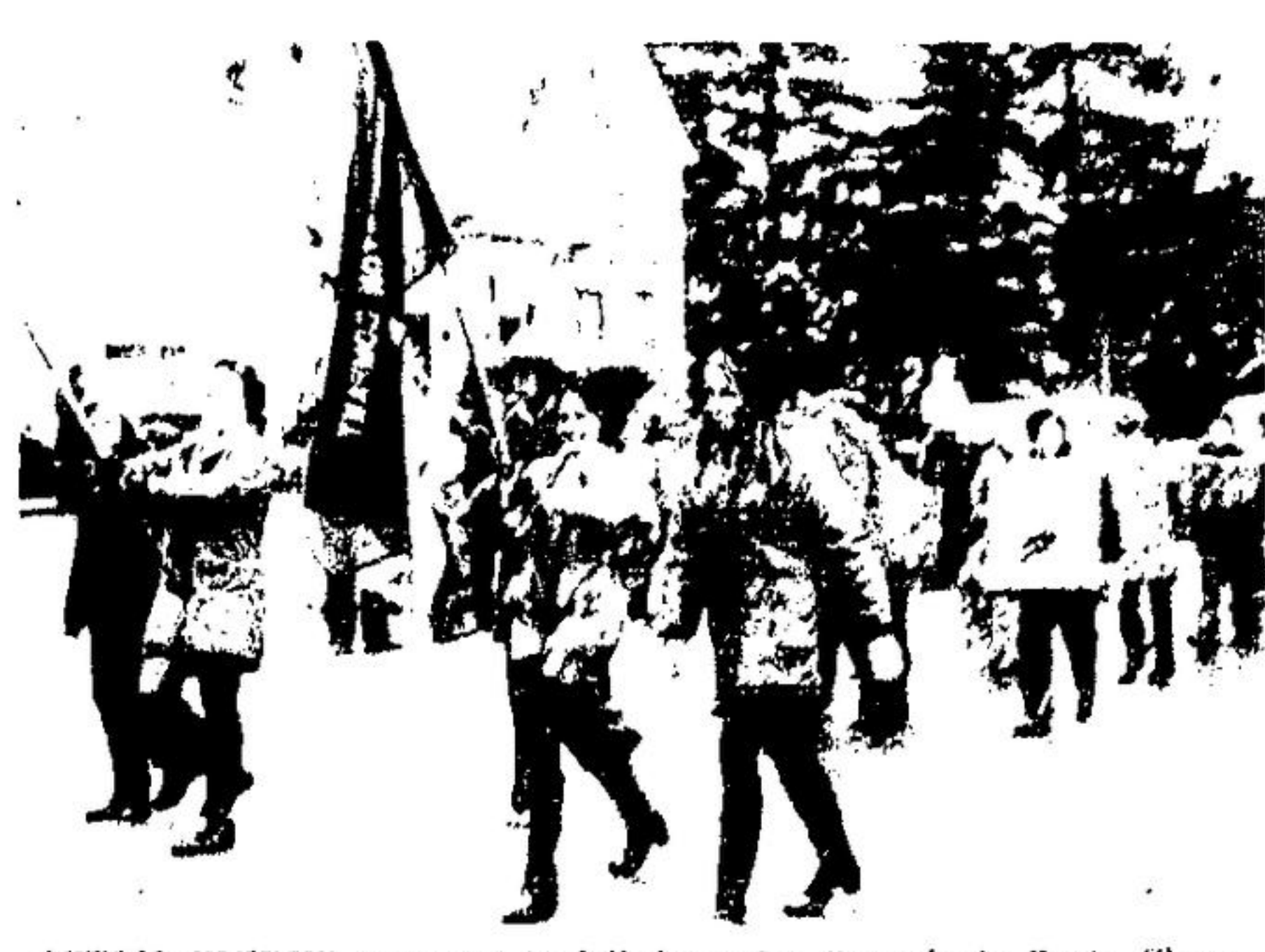
ACTON GUIDES were out in full force for Saturday's Santa Claus parade. Footing was slippery on the icy roads, but their flags were safe as the dedicated girls marched on. Behind them are the gift-wrapped brownies.