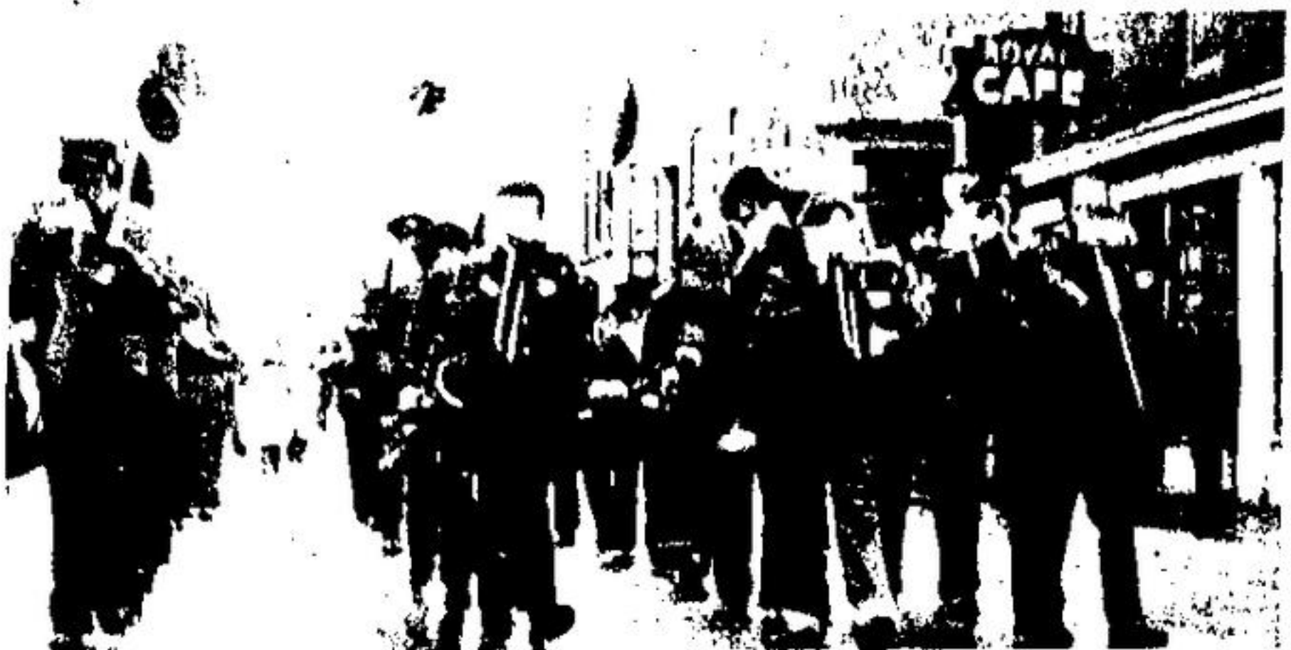
BLOWING HOT AIR to keep warm in Saturday's chilly weather, the Acton Citizens' Band members played melodious tunes during the Santa Claus parade on Saturday.