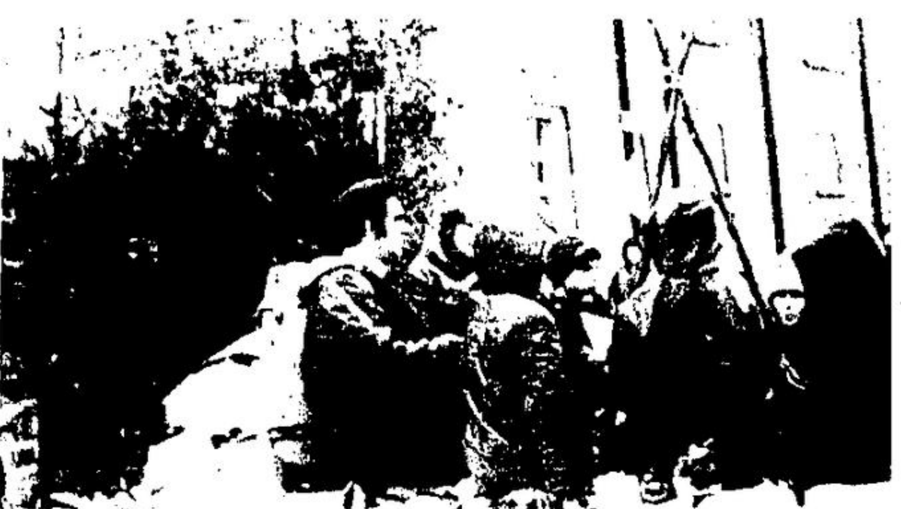
ACTON SCOUTS gather around a warm fire on their float during Saturday's Santa Claus parade. The freezing rain sent chills through their bodies. Actually, it wasn't a real fire.