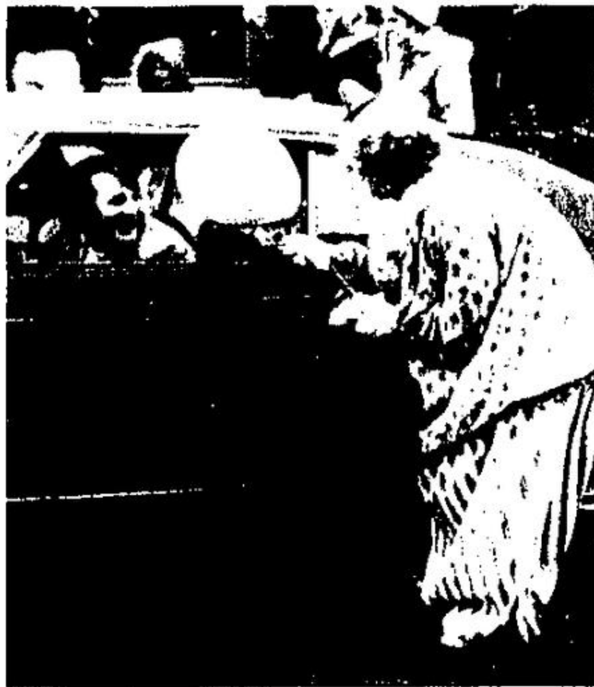
ADULTS WEREN'T left out of the excitement of Saturday afternoon's Santa Claus parade as a clown passes out candy to a carload.

—New wiring had been installed in the scout hall and there are now two stoves there. Both were put to good use for the first time in preparing the chocolate for the chilled paraders.