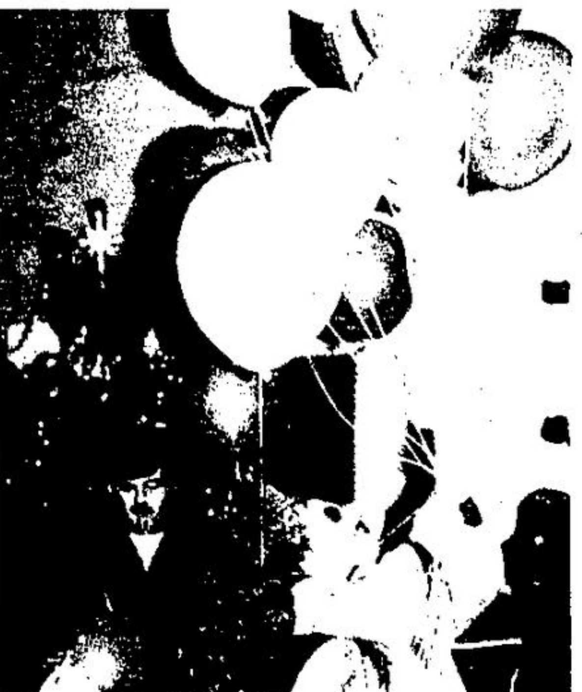
COLORFUL BALLOONS were given out Saturday at the Y after the parade, by an equally colorful clown.