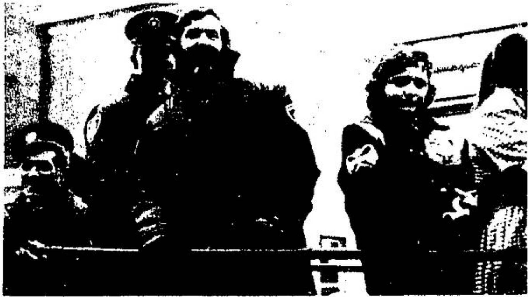
ACTON VOLUNTEER firefighters and children lined the back of the Studebaker fire truck for Saturday's Santa Claus parade. The truck was one of three exhibits the firefighters had in the parade and contributed to making it a big success.