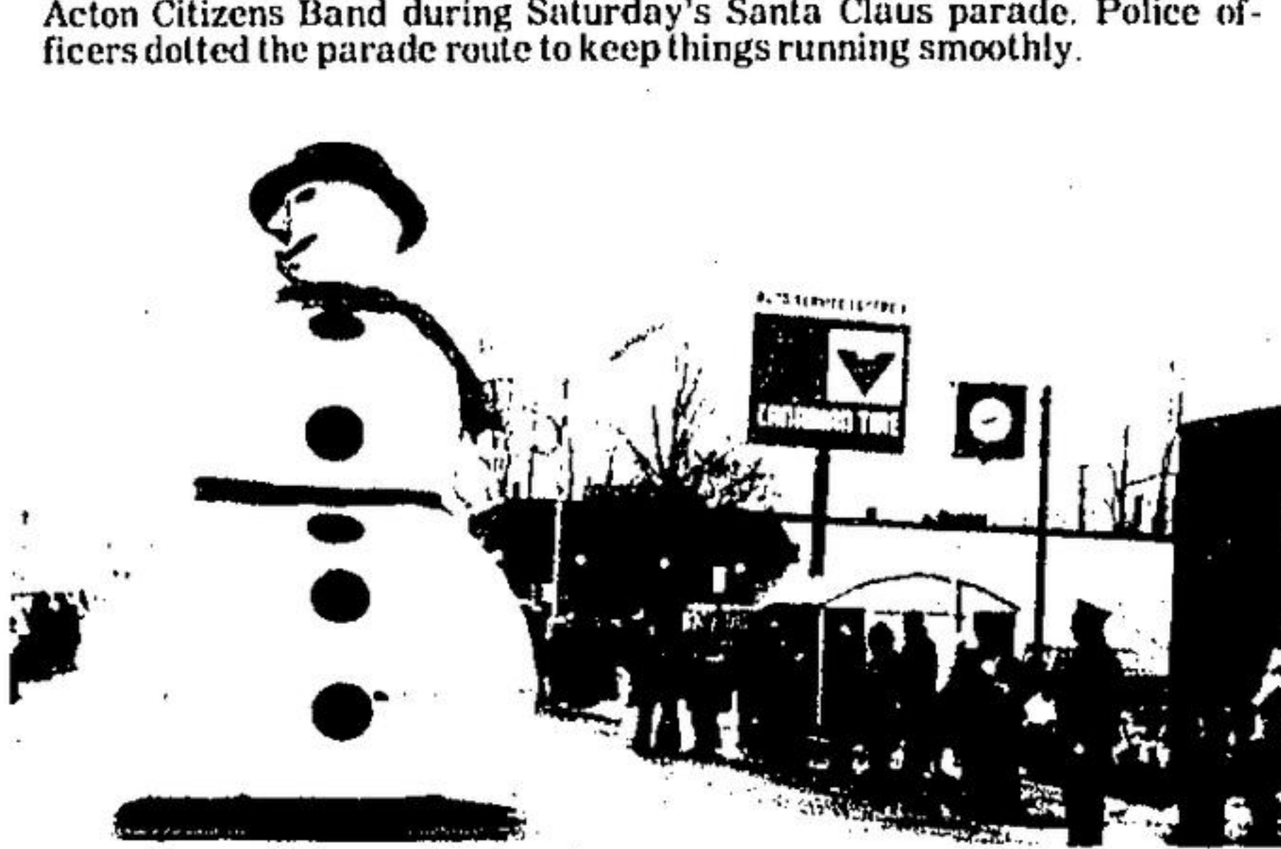
HUGE SNOWMAN walked down Mill St. on Saturday, and surprisingly enough, the freezing rain didn't harm him. The Acton Y's Men and Y's Menettes entered the replica of a snowman in the Santa Claus parade on Saturday.