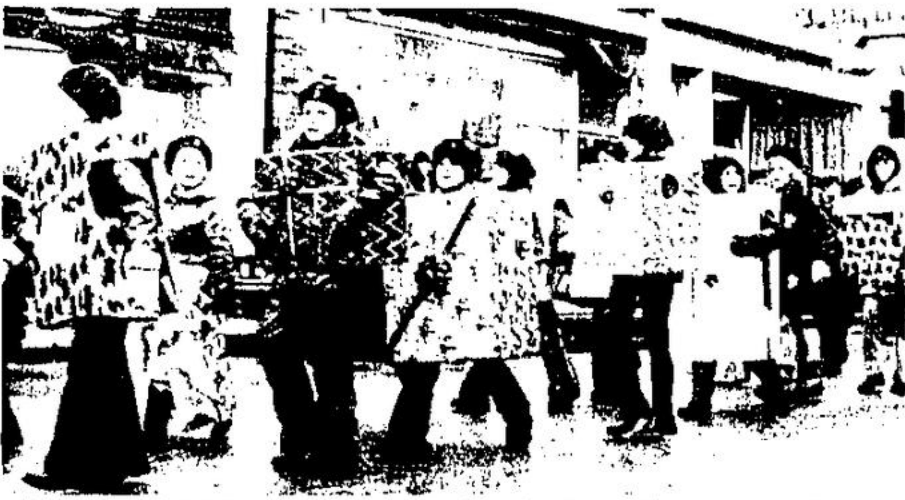
THE GIRLS WHO came gift-wrapped to the Santa Claus parade Saturday were the Acton Brownies. Bright colored wrapping paper covered boxes on most girls who would enhance any Christmas tree.