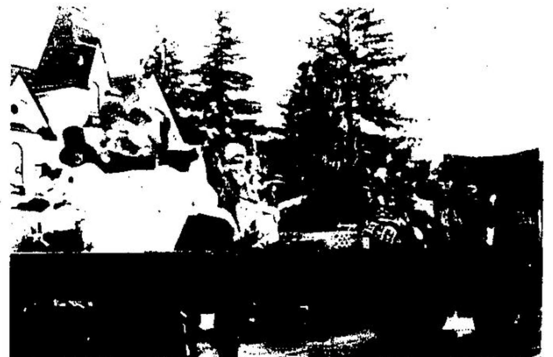
FIRST PRIZE WINNING float in Saturday's Santa Claus parade was from Speyside school. Children lined the gaily decorated flatbed and charmed the spectators and the judges.