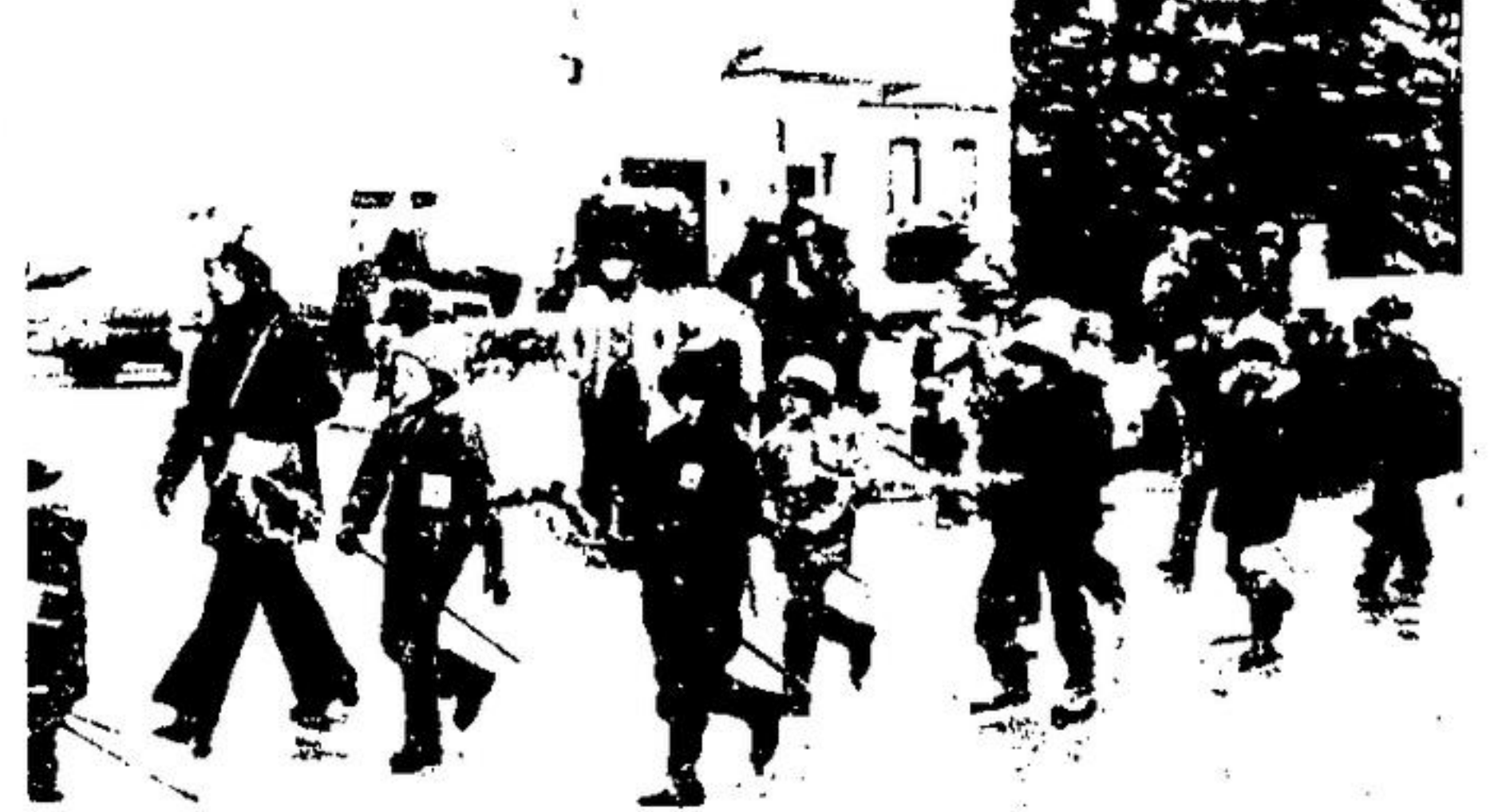
WHO SAYS YOU can't fool Mother Nature? Beavers and horses (disguised as sticks) got together for Saturday's Santa Claus parade, and the horses didn't even realize it was a Beaver and not a human on his back.