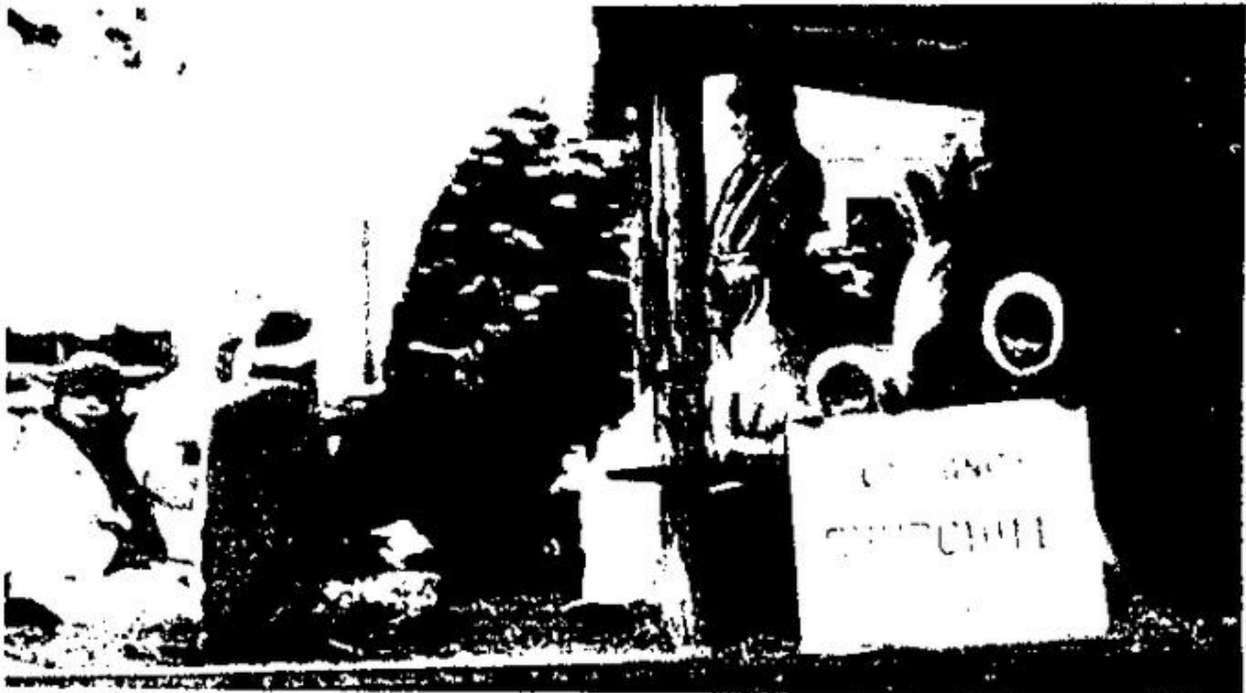
CHURCHILL COMMUNITY Church float saw area people come out to the Santa Claus parade Saturday. Freezing rains did not deter the youngsters from having a good time. The float won second prize.