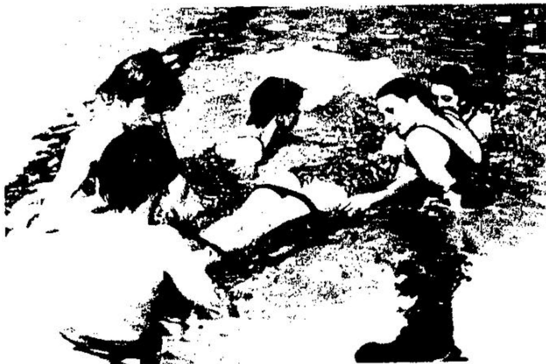
HIGH SCHOOL students show life-saving techniques in the water at the first aquatic show to be held in Acton's indoor swimming pool on Friday. Approximately 160 people watched the show from the sidelines.