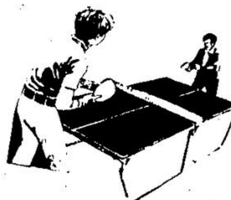
Table Tennis - fun for everyone

Play Beck ping pong table. Fold away 1/2" top. Painted regulation green. Easy to store has many other uses such as sewing, or train top.