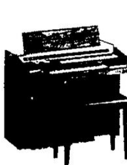
9322 $1195 00