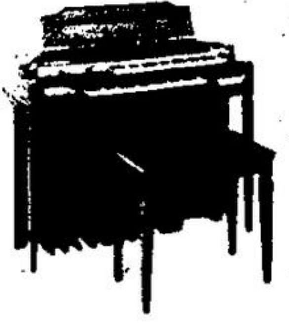
9512 $2295 00