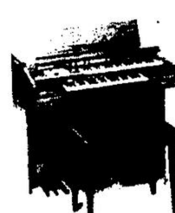
9722 $1495 00