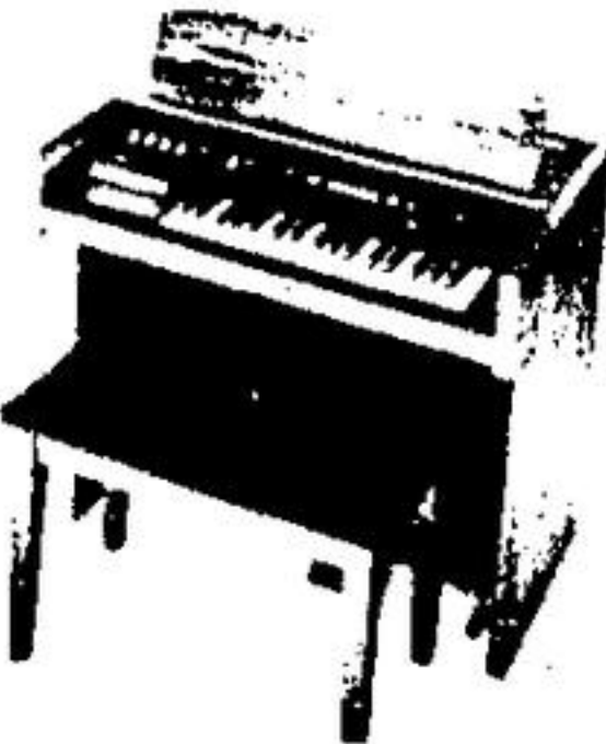
SOUNDER $599 00