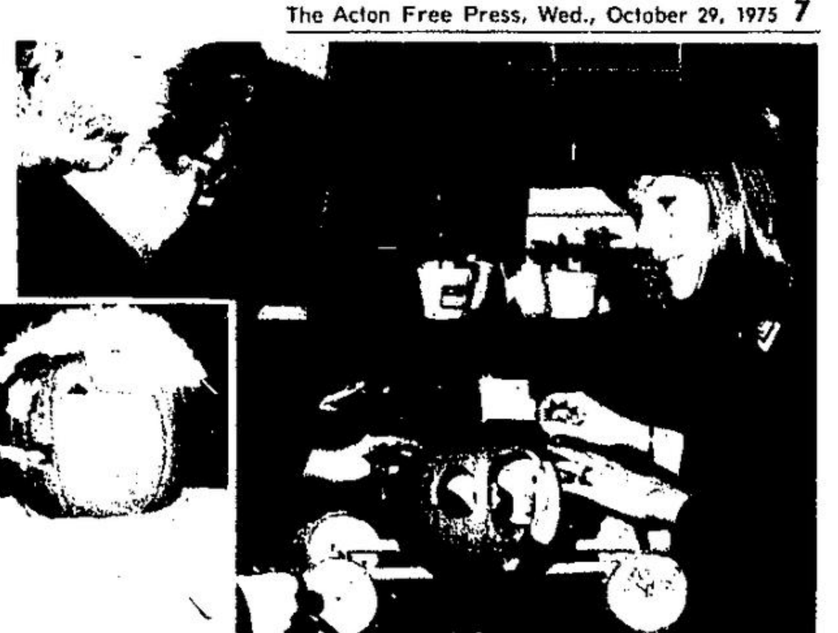
THE JUDGES pin a ribbon on Cinderella's coach, a real work of art at the pumpkin judging contest Saturday.