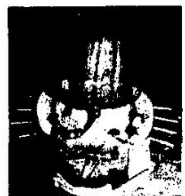
THE GOOD Ship Lollipop looked good enough to eat!