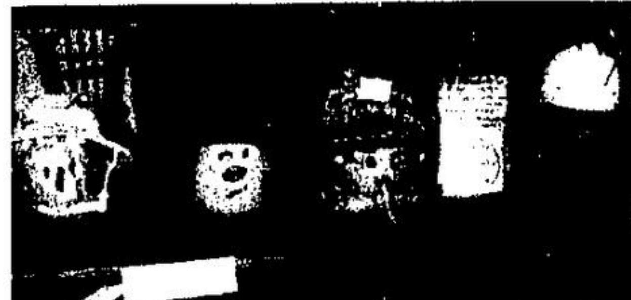
DO YOU recognize anybody? An example of the originality Rockwood kids used in dressing up their pumpkins at the contest Saturday.